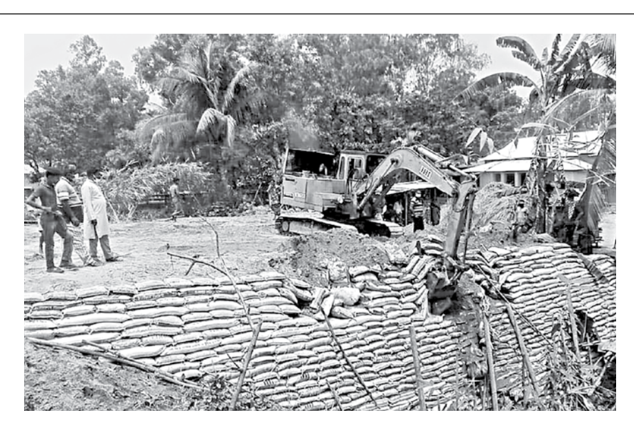
A mobile court in a drive recovered this portion of an important canal, illegally occupied by some local influential people. The photo was taken from Bhuanpara area in Tangail's Gopalpur upazila a few days ago.

But Sufia succumbed to her injuries at the hospital early yesterday.