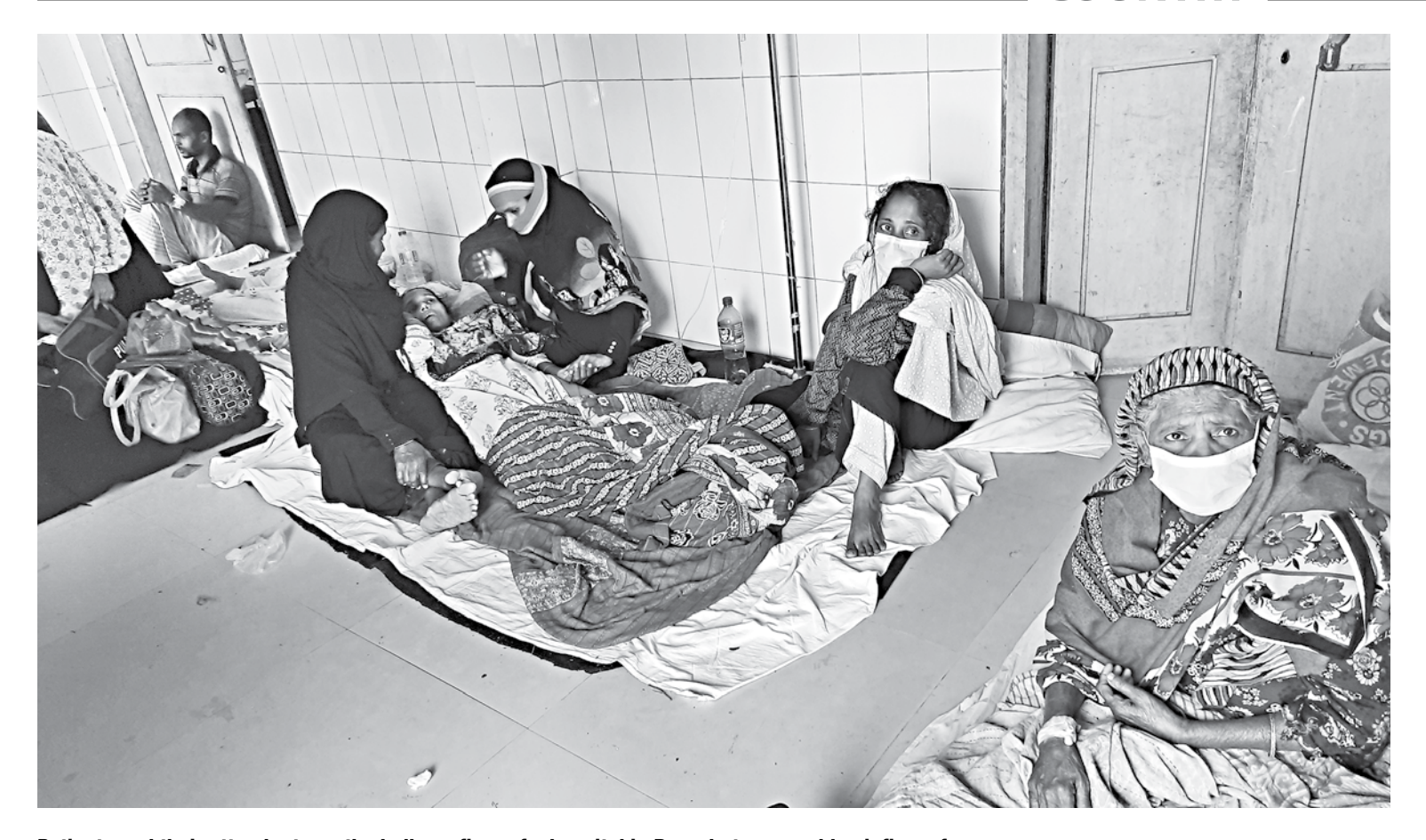
Patients and their attendants on the hallway floor of a hospital in Bagerhat as a sudden inflow of diarrhoea patients caused overcrowding at the medical facilities.