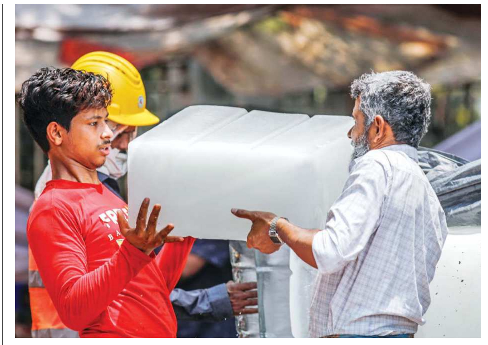
With Ramadan coming amid a scorching heat wave this year, the demand for ice is on the rise, especially for the working class. Some enterprising youths buy these blocks for Tk 300 each from the captial'sn Sadarghat, crush them up into smaller units, and sell them to juice vendors and iftar sellers. The photo was taken near Shahbagh yesterday.

They were produced before a court, which sent them to jail.