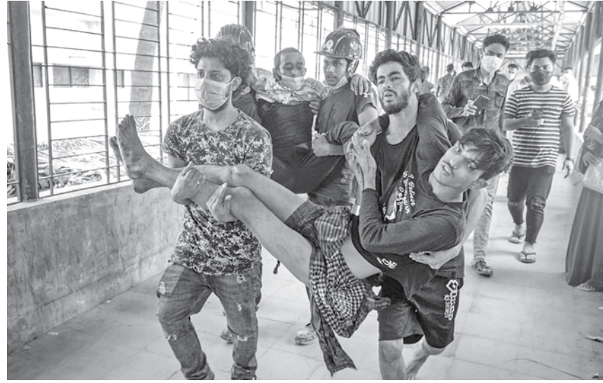
An injured worker of under-construction SS Power I Plant is being taken to Chattogram Medical College Hospital. Five workers were shot dead when they were demonstrating for salaries of up to three months in arrears.

To that end, it is also important to question the proportionality of firing 332 shots at an unarmed protest. The police stated that they fired bullets in self-defence and to protect property. While that is allowed under the Penal Code 1860, such defence (known legally as “private defence”) undertaken for protection of a person or property must be proportionate to the perceived threat.