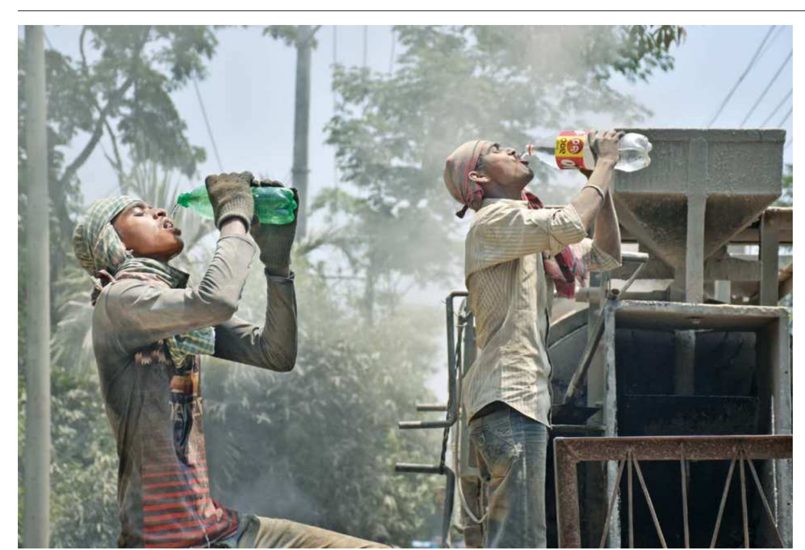
On road construction duty in the burning heat of yesterday's noon, two workers take a break from mixing stone with bitumen and to rehydrate themselves. A heat wave is sweeping the country, and those who have to do hard physical labour -- especially outdoors -- are taking the heat, quite literally. This photo was taken from Barishal city's Kaladema area.