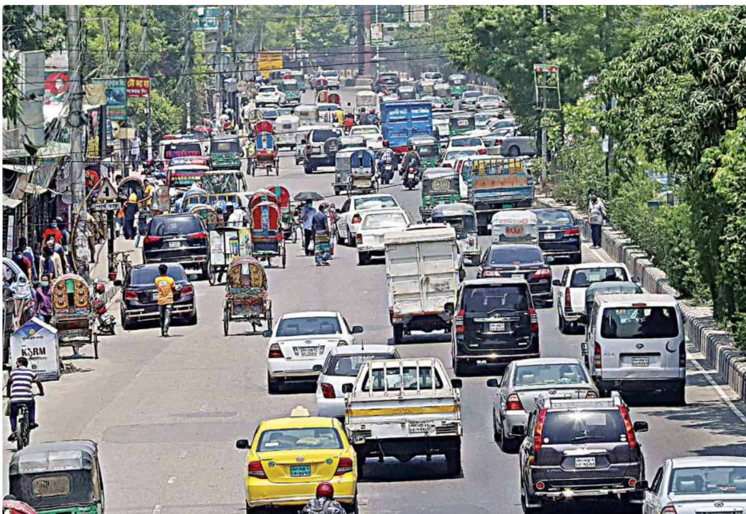
Amid the "strict lockdown" that has been imposed by the government to prevent the spread of deadly coronavirus, private and public vehicles, except buses, are plying on the streets quite normally. The photo was taken on Mirpur road in the capital's Shyamoli area yesterday.