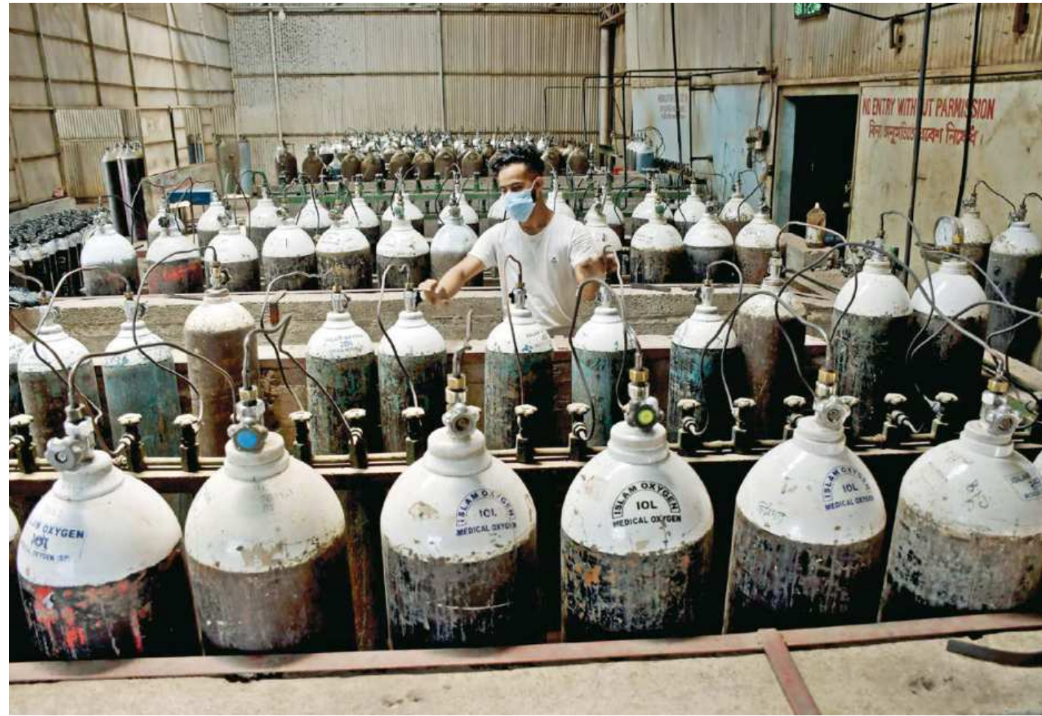
The demand for oxygen is skyrocketing in the country with the number of cases and deaths related to coronavirus. A worker is refilling cylinders at a station in Narayanganj to meet the demand. Many such factories are kept open round the clock for the heavy workload.