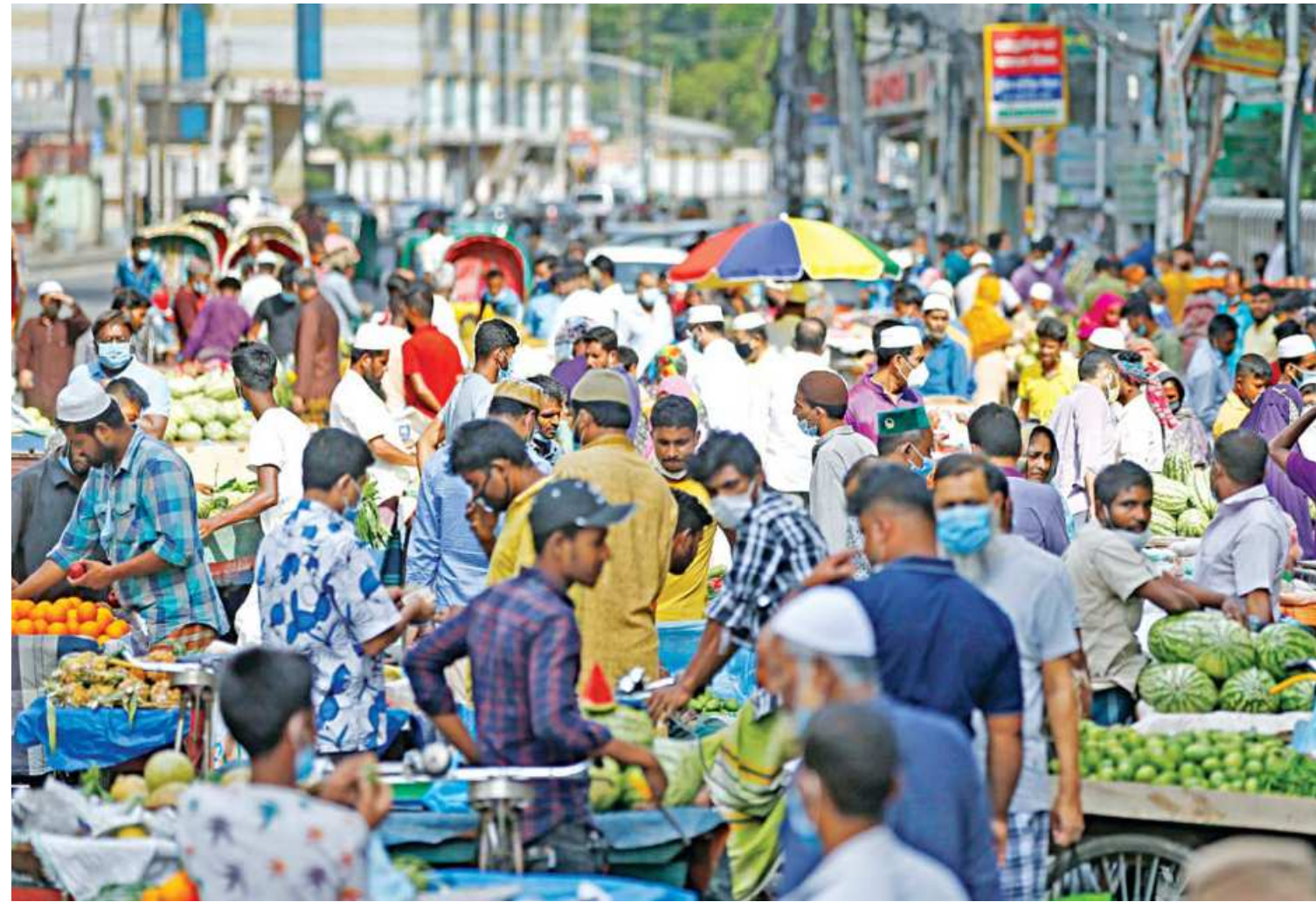
Shoppers through an open-air fruit market in the capital's Purana Paltan opposite Baitul Mukarram after Juma prayers yesterday. Even amid restrictions imposed to curb the spread of Covid-19, the tightly packed crowd of people show very little awareness of social distancing.