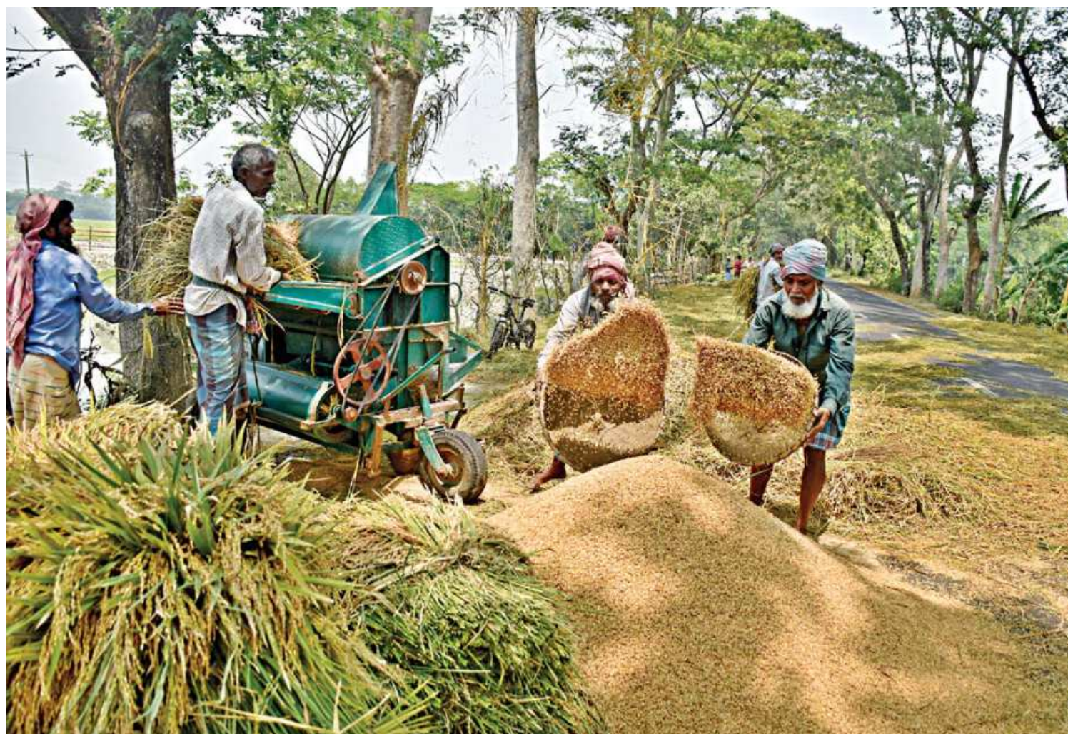
Farmers feeding freshly harvested Boro paddy into a threshing machine and spreading the processed crop out on the Barishal-Khulna highway. The photo was taken from Daharpara area of Jhalokathi district on Thursday.