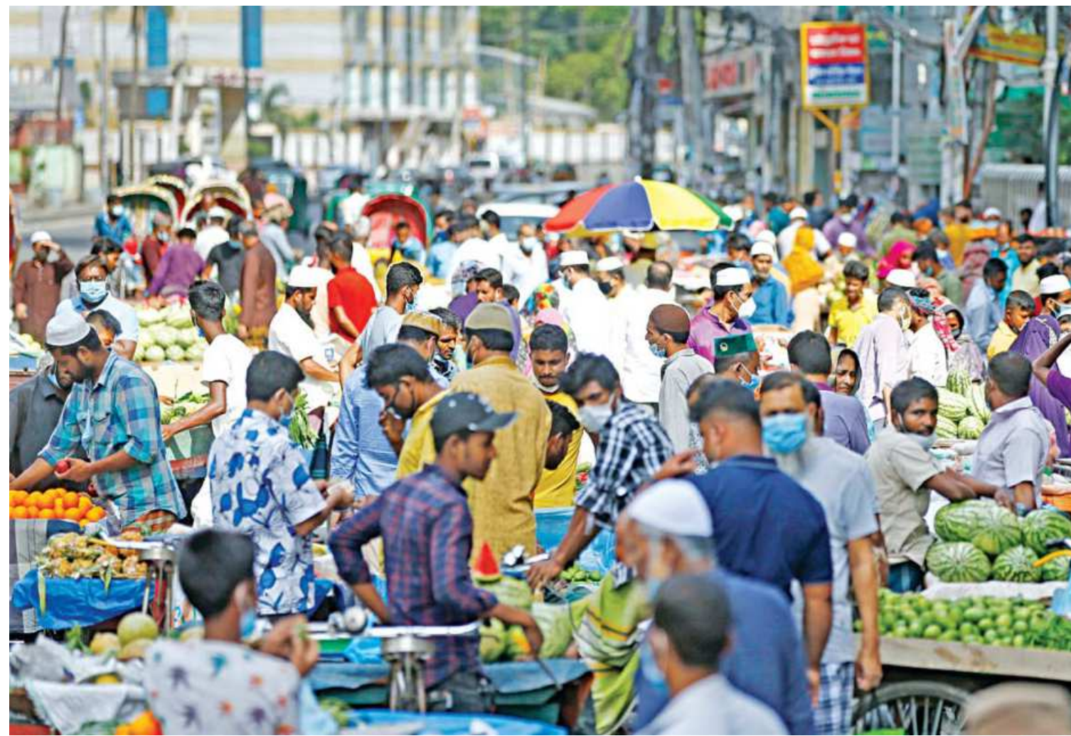
Shoppers throng an open-air fruit market in the capital's Purana Paltan opposite Baitul Mukarram after Juma prayers yesterday. Even amid restrictions imposed to curb the spread of Covid-19, the tightly packed crowd of people show very little awareness of social distancing.