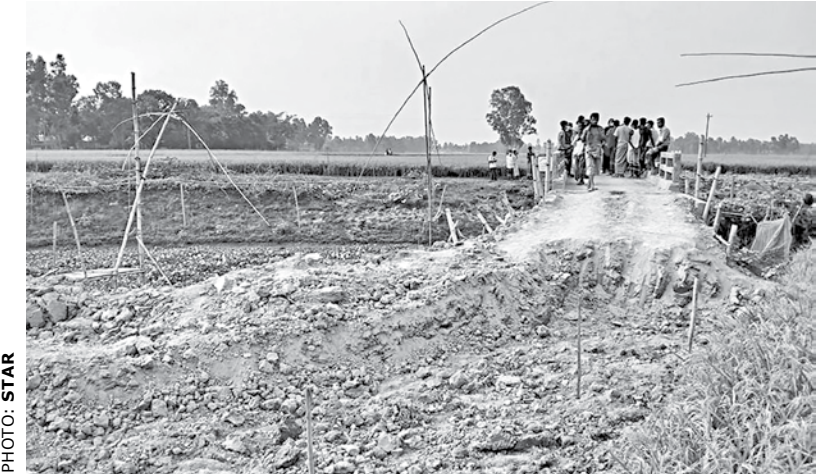
Movement of both people and vehicles remains suspended as a local influential man has cut off soil from the approach road of a bridge on a government road at Chatutia village in Tangail’s Dhanbari municipality.