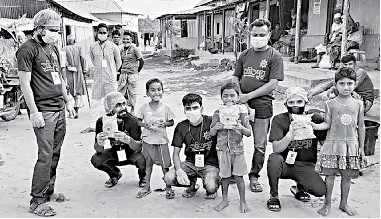
Three young children all smiles after getting packets of Iftar from members of ‘Trishitopur’, a voluntary social organisation in Kendua upazila of Netrakona. The organisation has been distributing 100 Iftar packets every day among the disadvantaged for a token price of Tk 2.