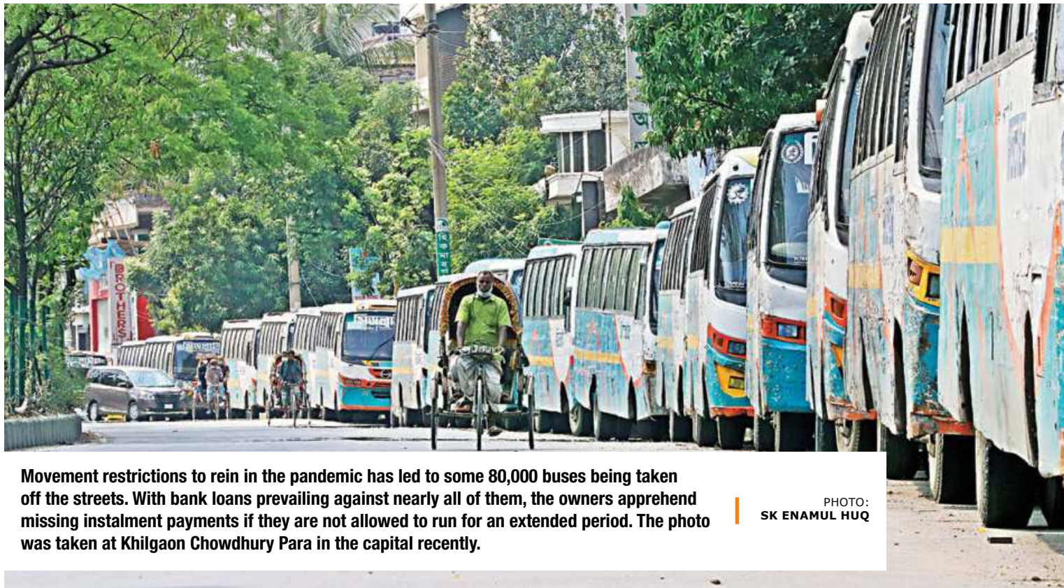
Movement restrictions to rein in the pandemic has led to some 80,000 buses being taken off the streets. With bank loans prevailing against nearly all of them, the owners apprehend missing instalment payments if they are not allowed to run for an extended period. The photo was taken at Khilgaon Chowdhury Para in the capital recently.

DHAKA FRIDAY APRIL 23, 2021, BAISHAKH 10, 1428 BS • starbusiness@thedailystar.net