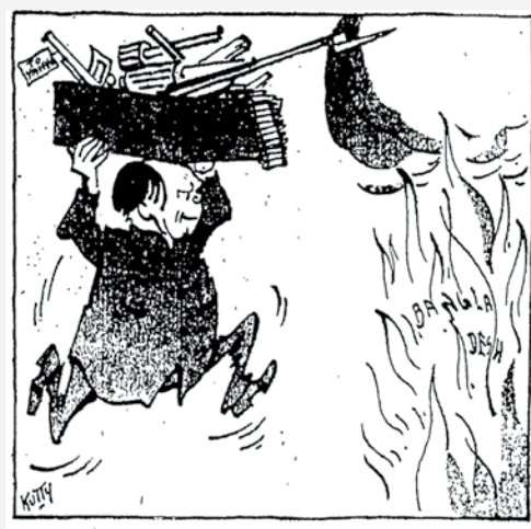
The caricature depicting China's arms assistance to Pakistan was published in the Hindustan Standard on April 22, 1971.