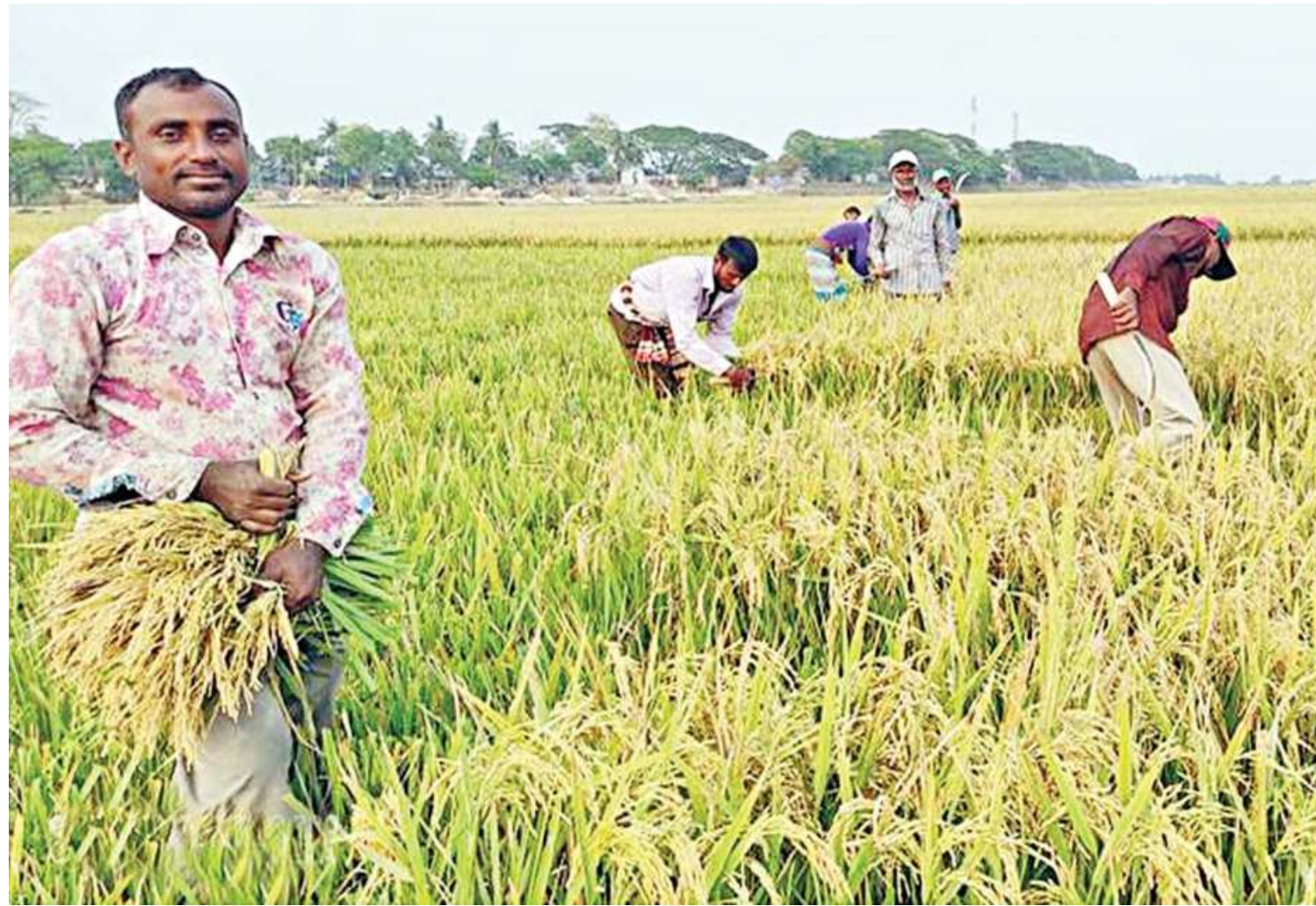
Farmers of Kirtankhola haor in Netrakona's Khaillajuri upazila are overjoyed harvesting over 60 percent of the paddy they grew. The Brri Dhan-28, which these farmers had cultivated, is a Boro variant that can be cut and collected earlier than most other variants. The photo was taken yesterday.