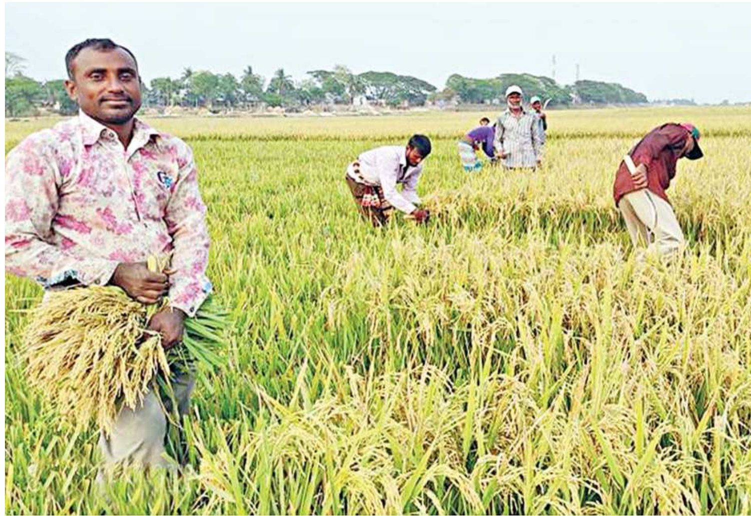
Farmers of Kirtankhola haor in Netrakona's Khaillajuri upazila are overjoyed harvesting over 60 percent of the paddy they grew. The Brri Dhan-28, which these farmers had cultivated, is a Boro variant that can be cut and collected earlier than most other variants. The photo was taken yesterday.