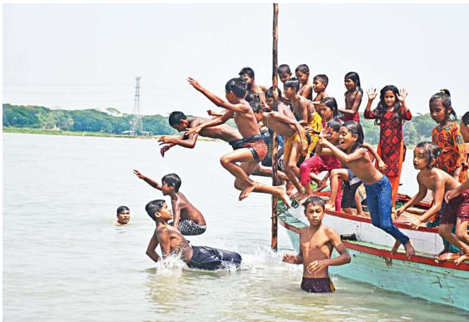
With the sweltering summer sun bearing down on them, children in Barishal leap into the Kirtankhola river, from a goods-laden trawler, for a sweet relief from extreme heat. The photo was taken in the district's Polashpur area yesterday.