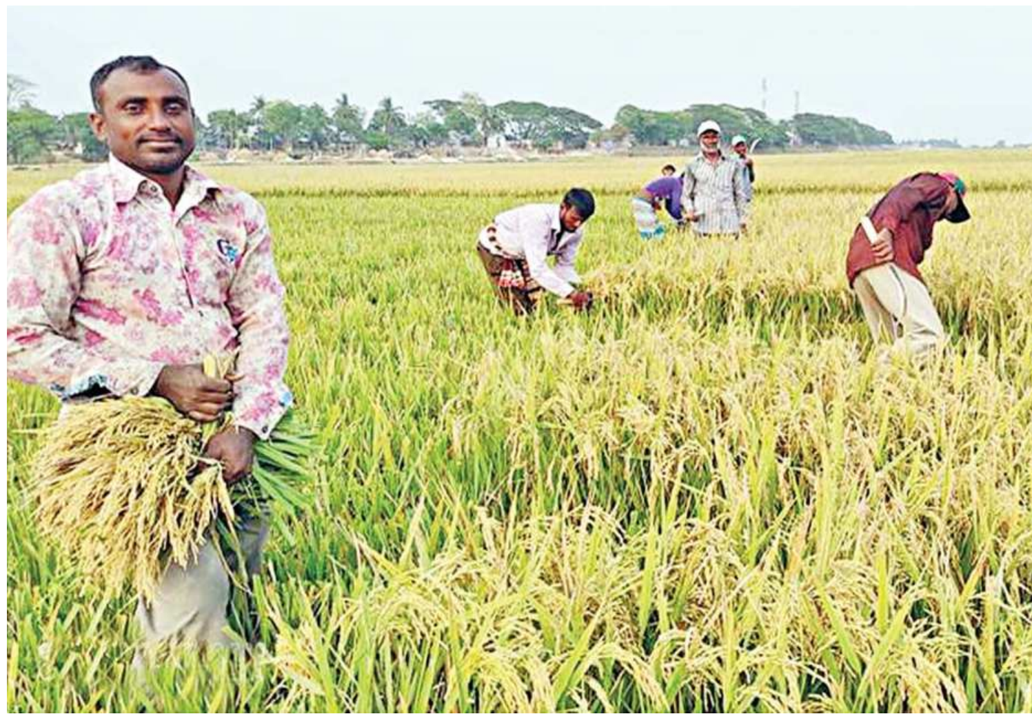
Farmers of Kirtankhola haor in Netrakona's Khaillajuri upazila are overjoyed harvesting over 60 percent of the paddy they grew. The Brri Dhan-28, which these farmers had cultivated, is a Boro variant that can be cut and collected earlier than most other variants. The photo was taken yesterday.