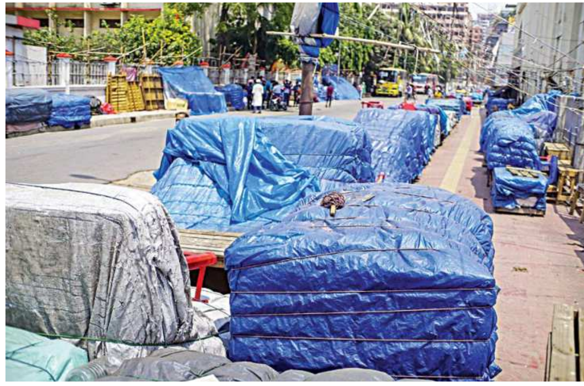
Unsold goods and other possessions of street vendors covered in plastic sheets are left on the footpath in front of Baitul Mukarram mosque in the capital. Coronavirus restrictions have forced the vendors, who usually enjoy brisk trade in Ramadan, to leave their shops like this.

Last year, bKash successfully distributed the cash aid of the PM to nearly 1 million families.