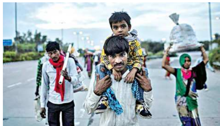
Migrant workers walk along a road to return to their village, during a 21-day nationwide lockdown to limit the spreading of coronavirus, in New Delhi, India last year.

"As micro-containment zones are being set-up and markets shut, the police are in charge on the streets. On the pretext of pandemic