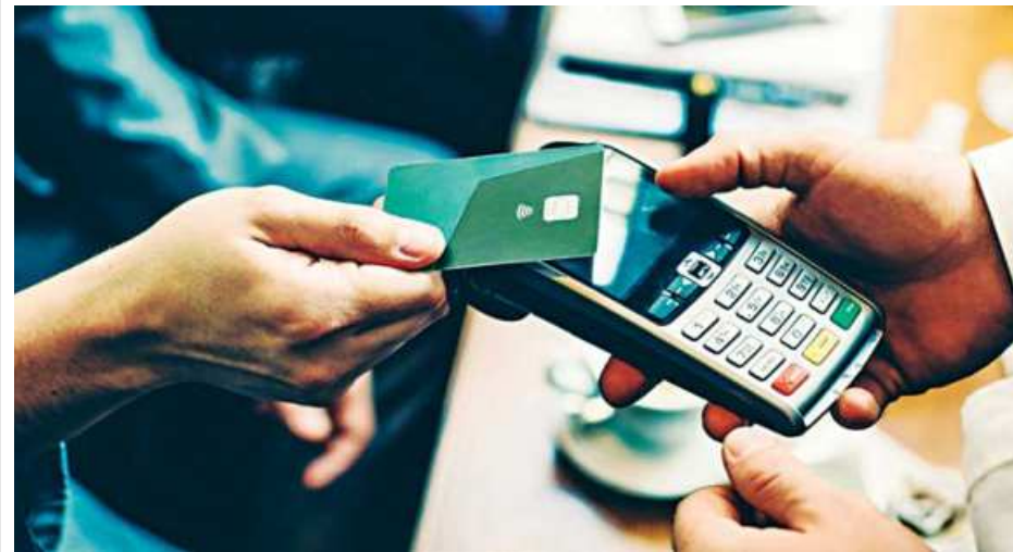
Cards have become crucial instruments of contactless payment, ushering in the use of alternative and internet banking channels.