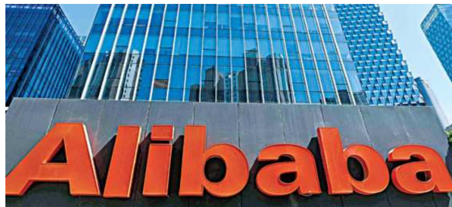
An Alibaba sign is seen outside the company's office in Beijing on April 13.

(2) The combined nationwide turnover within China of all the undertakings concerned in the preceding financial year is more than 2 billion yuan, and the nationwide turnover within China of each of at least two of the undertakings concerned in the preceding financial year is