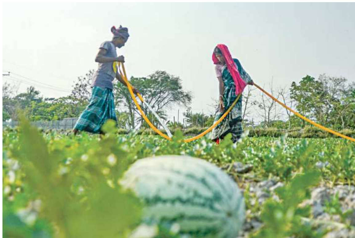
Farmers in Khulna were encouraged by last year's results and began to cultivate watermelon on larger plots as it brought more profit than other traditional crops.

On April 1, this correspondent visited a number of villages in the region, where hundred of