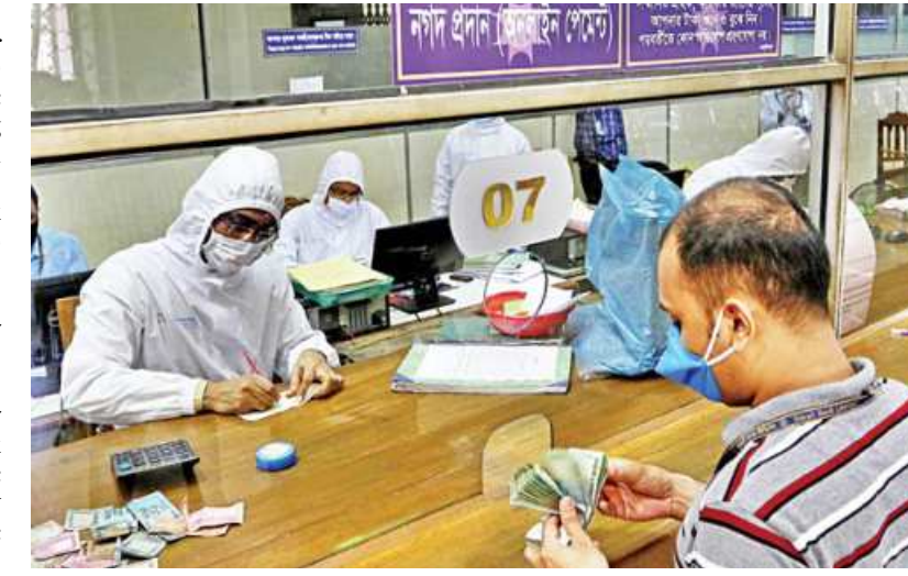
Clients will be allowed to conduct banking activities from 10:00am to 1:00pm during this period.

Upon hearing the announcement, thousands of clients thronged the clients, Bangladesh Bank revised its