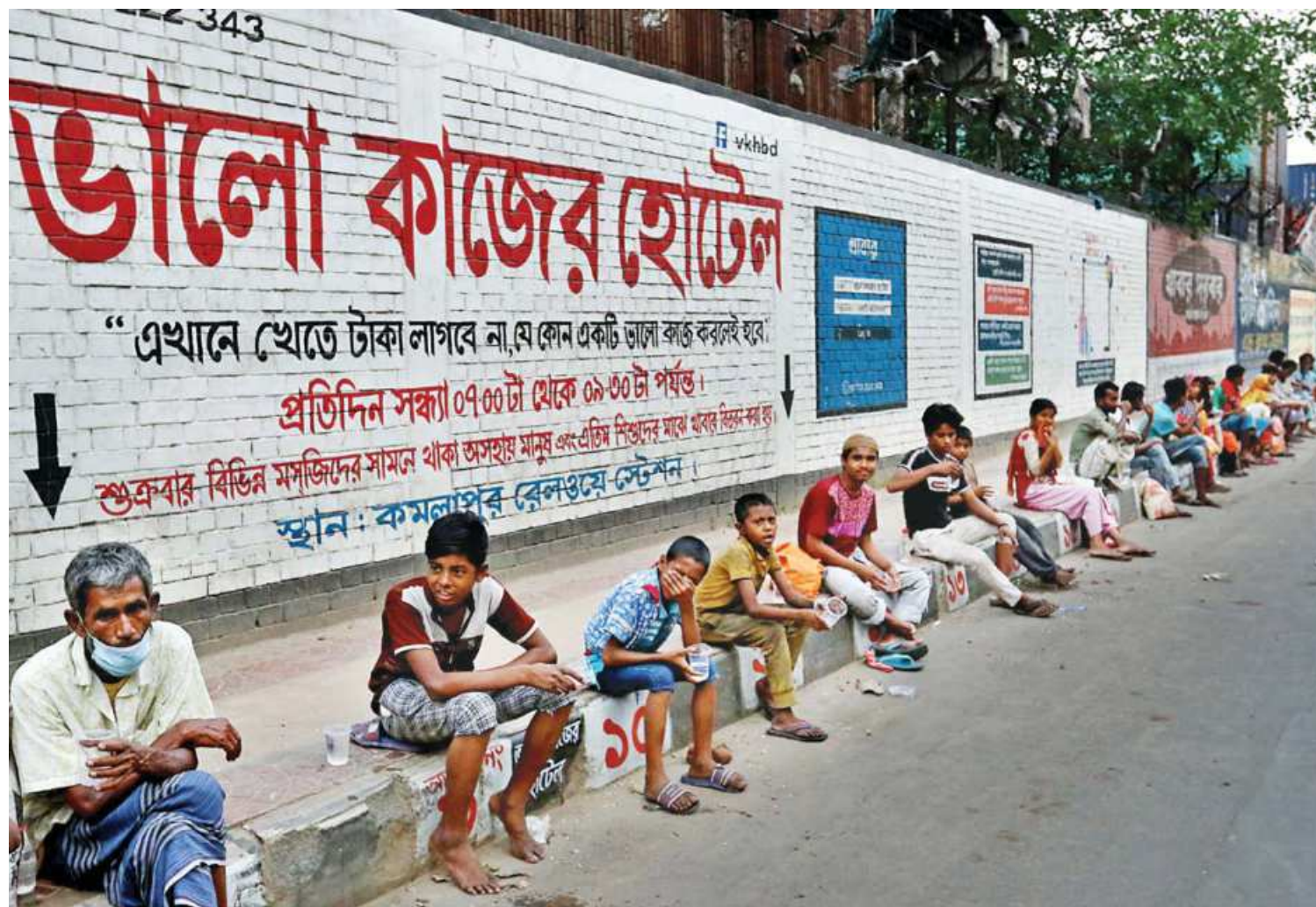
People of all ages sitting in front of the "Bhalo Kaajer Khabar Hotel" near Kamalapur Railway Station in the capital. Run by school-going children scattered all across Dhaka, who dream of doing good for the nation through their own expenses, the hotel has been distributing free food to the poor and will be doing so throughout the holy month of Ramadan during this pandemic. The photo was taken yesterday.