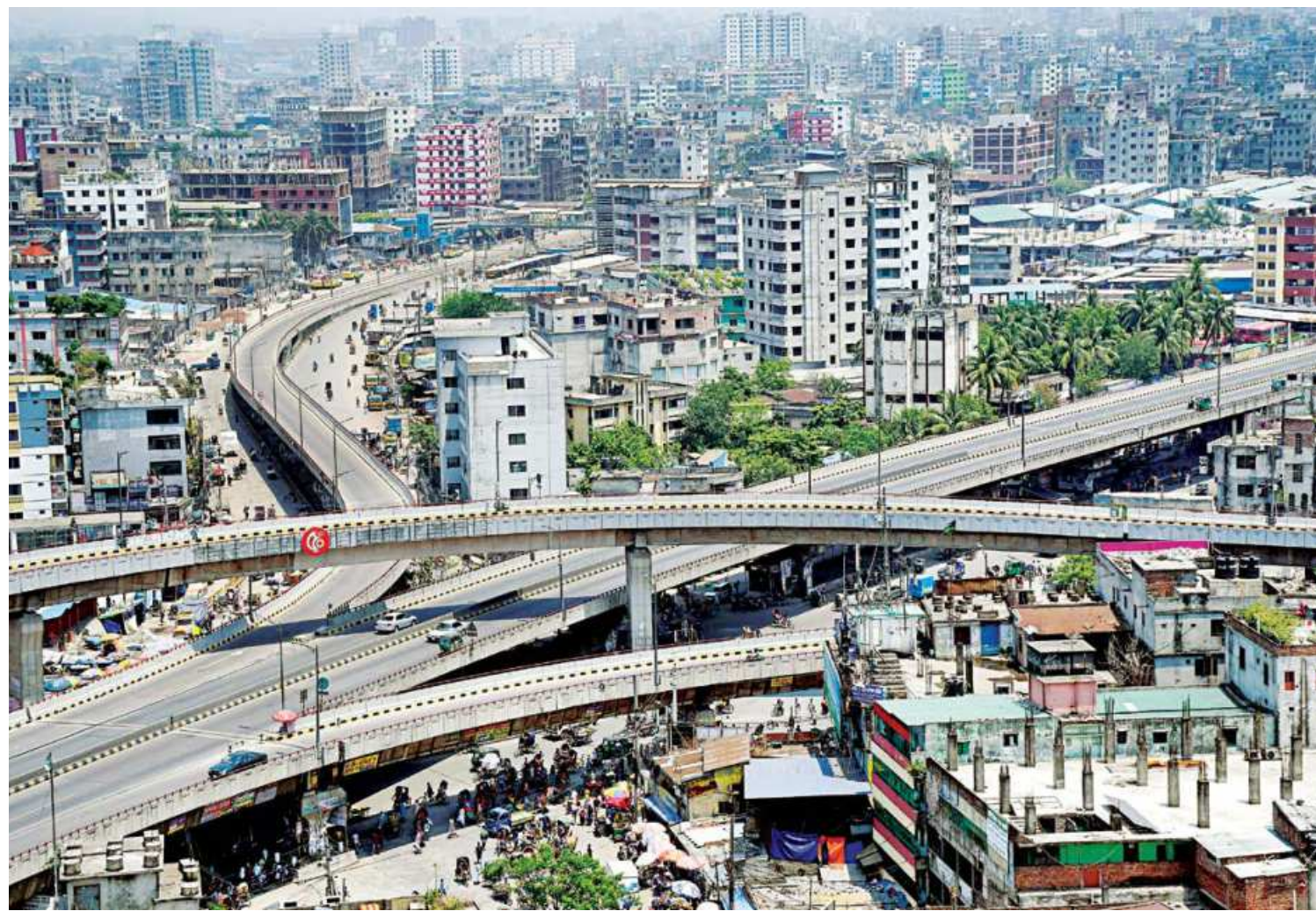
The Mayor Hanif flyover in the capital's Jatraabari area is usually teeming with vehicles. However, it has been almost empty since a "lockdown" was enforced by the government from April 14 to curb the spread of the novel coronavirus. The photo was taken yesterday afternoon.