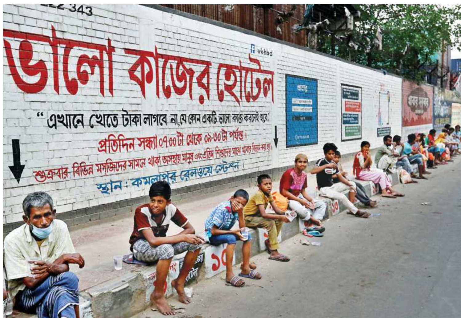
People of all ages sitting in front of the "Bhalo Kaajer Khabar Hotel" near Kamalapur Railway Station in the capital. Run by school-going children scattered all across Dhaka, who dream of doing good for the nation through their own expenses, the hotel has been distributing free food to the poor and will be doing so throughout the holy month of Ramadan during this pandemic. The photo was taken yesterday.