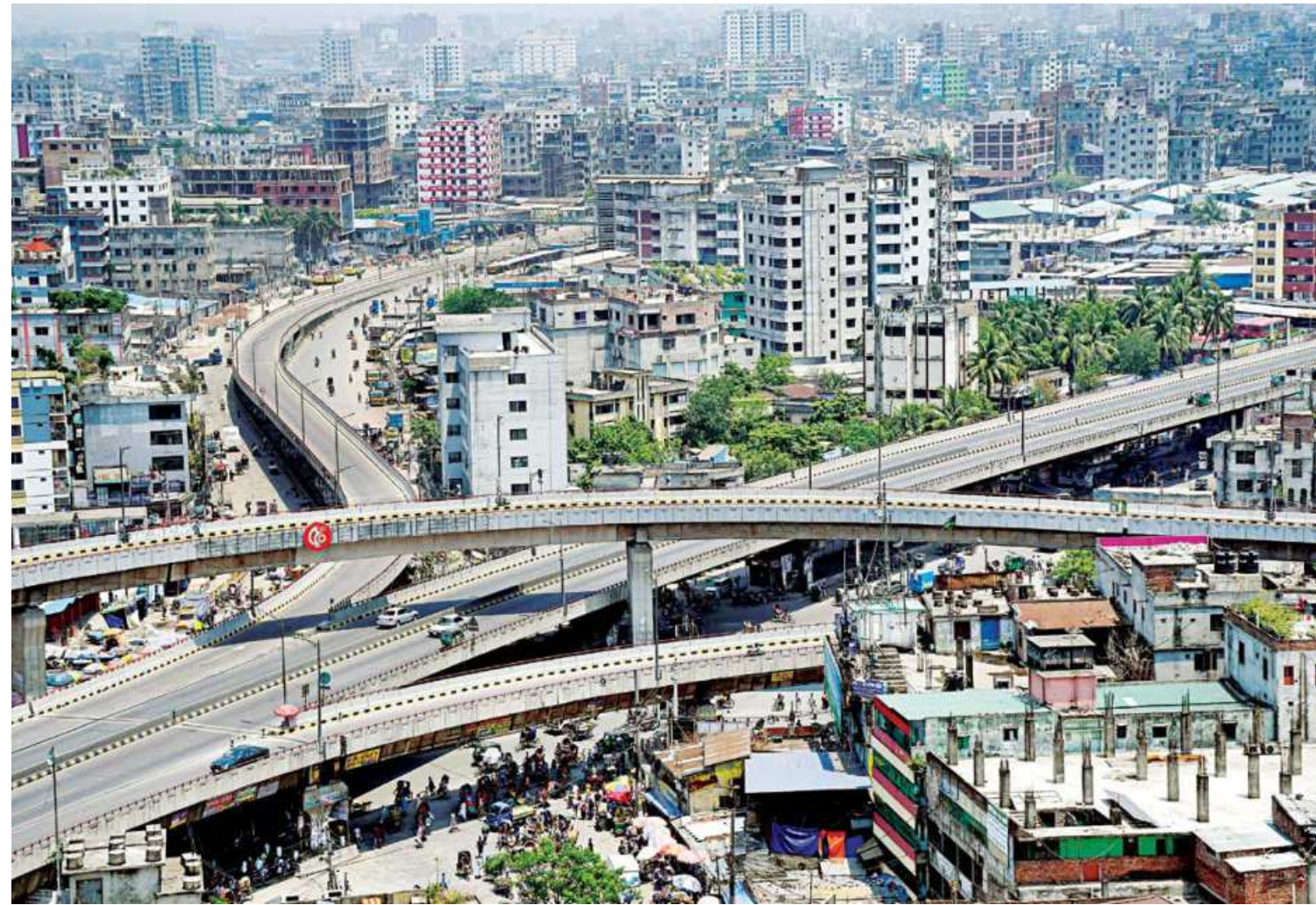
The Mayor Hanif flyover in the capital's Jatrabari area is usually teeming with vehicles. However, it has been almost empty since a "lockdown" was enforced by the government from April 14 to curb the spread of the novel coronavirus. The photo was taken yesterday afternoon.