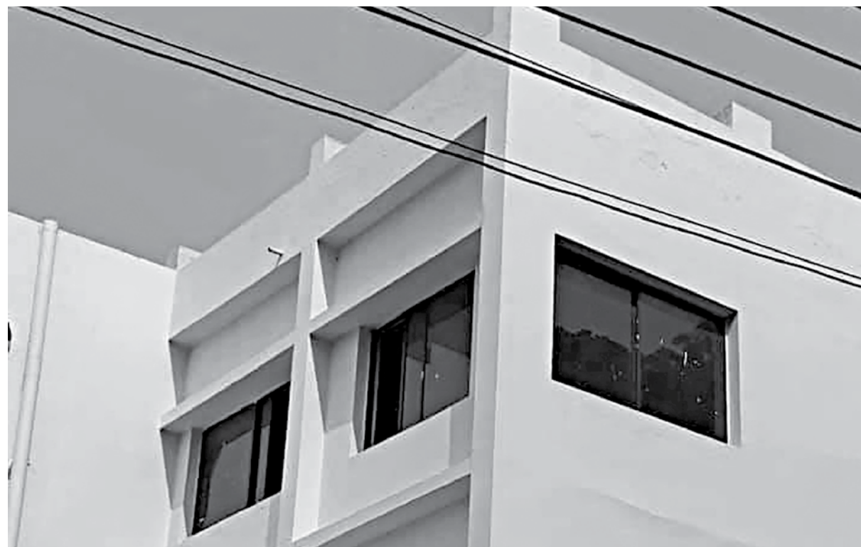
A number of Covid patients are increasing but an ICU is yet to be set up at Tangail 250-bed Tangail General Hospital.

Although they won inheritance rights to the property at the court, the government is withholding its handover by filing a counter case, he said, adding that once all the legality is settled, his family would hold discussions with locals as to how the property should be preserved.