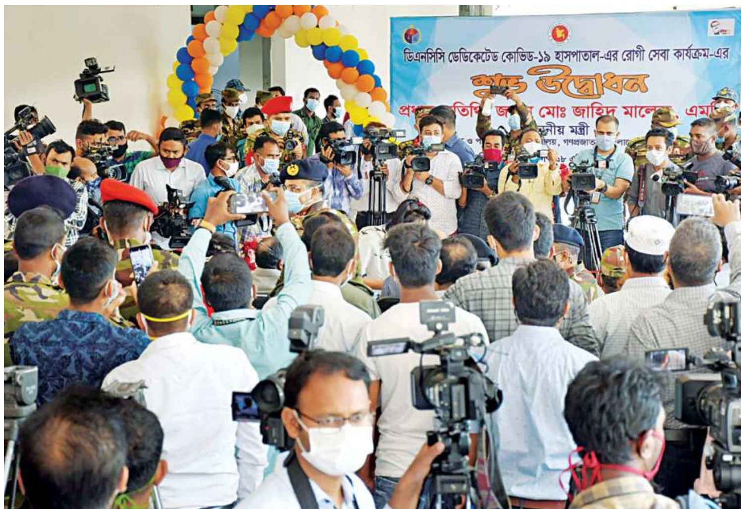
This photo shows social distancing, one of the main guidelines to contain the spread of coronavirus, not being maintained when health minister inaugurated the country's largest Covid-19 hospital at Dhaka North City Corporation's Mohakhali market yesterday. The ceremony was organised despite strict Covid restrictions enforced by the government.