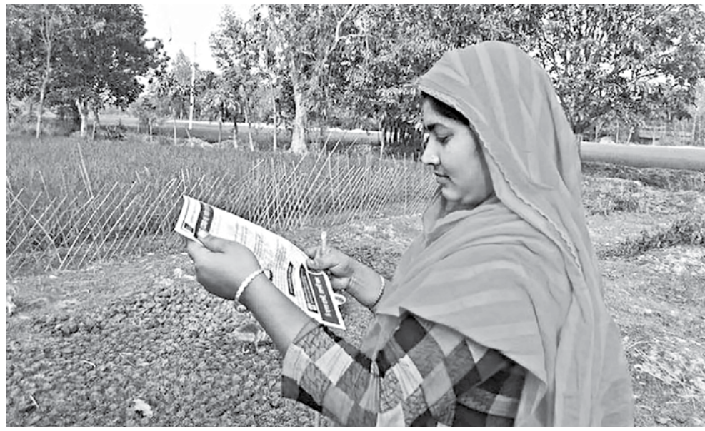
A quick survey in THP’s working areas revealed that the CRV initiative has been producing very positive results.

For risk communication and behavioural change, the volunteers carried out 3W campaigns to promote washing hands, watching distances, and wearing masks. To create behavioural change, which is difficult and time-consuming, trained volunteers repeatedly took turns sitting with 20-25 families, using specialised communication materials. They held courtyard meetings to create awareness among mothers against