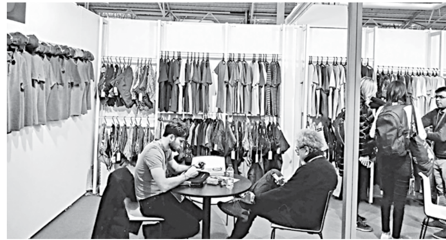
Sooner or later, any business needs orders, and empty order books have been an ongoing issue for all since last March.

Manufacturers of all sizes have been able to access various forms of finance to stay afloat but, unless a business has some money of its own in the bank, there is only so long it can survive on government loans