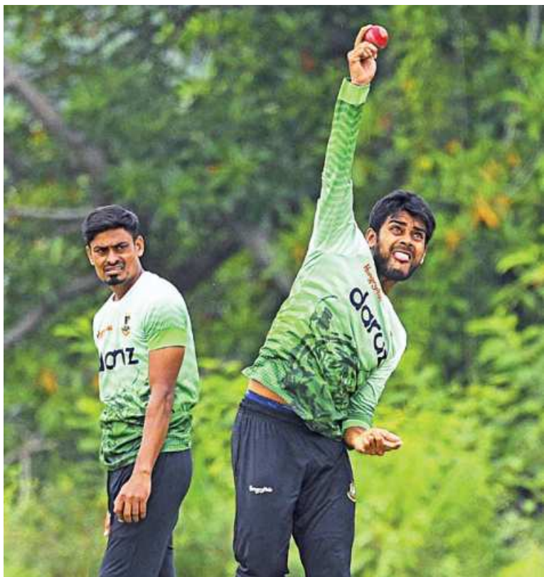
Bangladesh spinner Mehedi Hasan Miraz bowls during a practice session while left-arm spinner Taijul Islam looks on before the start of intra-squad warm-up match yesterday.