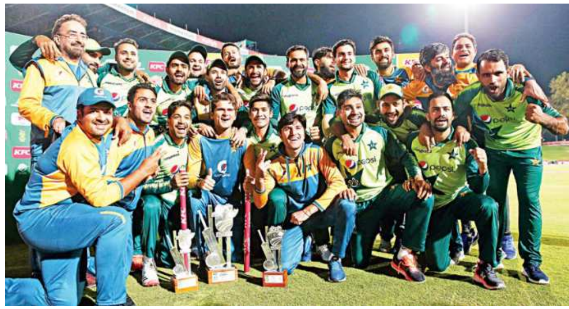
Pakistan players celebrate their series victory against South Africa following three-wicket win in the fourth Twenty20 international on Friday.