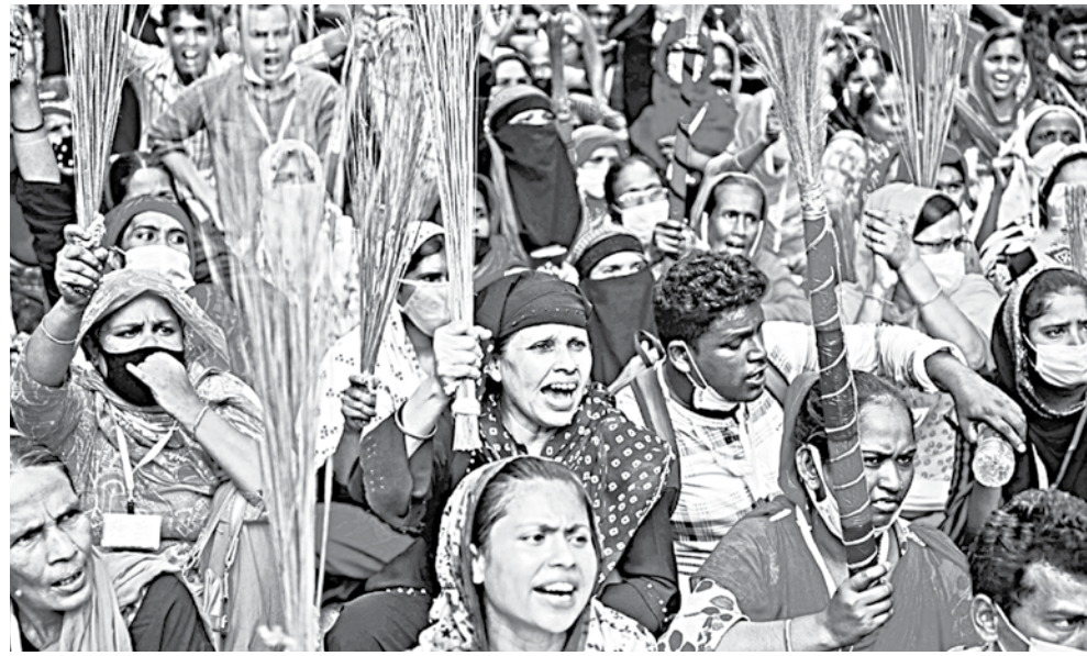
Many workers who lost their jobs have been languishing in poverty as the pandemic-induced shocks have curbed alternative employment opportunities.

the mobility of labour, job losses in one sector were compensated by job gains in other sectors; for example, either through the movements from agriculture to industry and services or through movements within the sub-sectors of agriculture, industry and services. But, during the pandemic, options for such adjustments and relocation of labour are limited and uncertain. There are grave future implications of the current labour market challenges. The recovery in the labour market is dependent on the recovery of the overall economy. However, the economic recovery process has remained slow and disrupted. The economic recovery is also happening at the cost of inter-generational trade-off with high adjustment