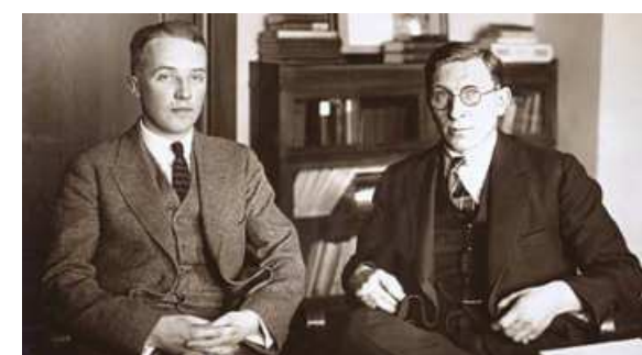
Frederick Banting & Charles Best at the UofT.