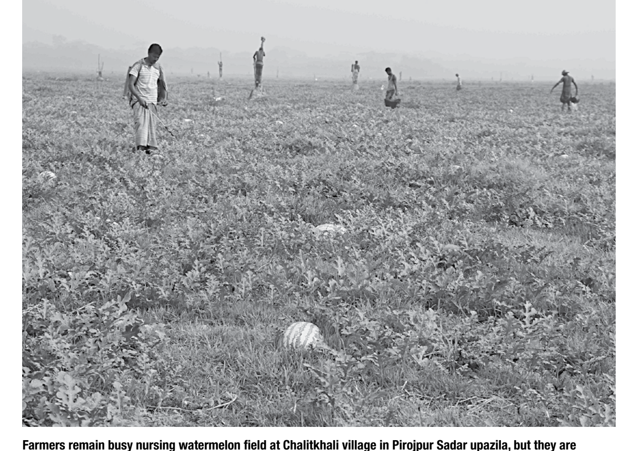
worried over selling the fruit due to countrywide lockdown.