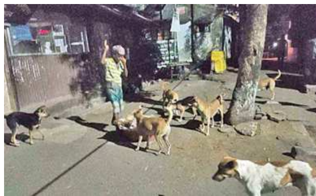
A group of dogs, tails wagging in excitement, surround a volunteer as he brings them a home-cooked meal.