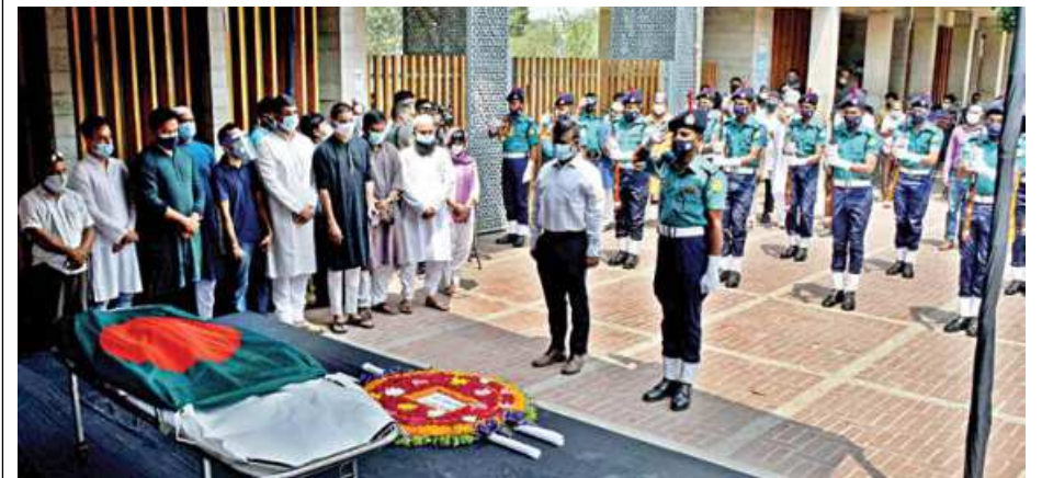
The 'sweet girl' of Dhallywood is given a guard of honour.