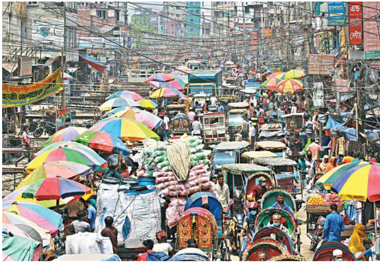
Many streets in the capital, including this one at Shonir Akhra area, were full of people and vehicles of all kinds yesterday, the fourth day of the weeklong lockdown. With daily earners losing their source of income, many have decided to go out and make whatever money they can get through the restrictions.