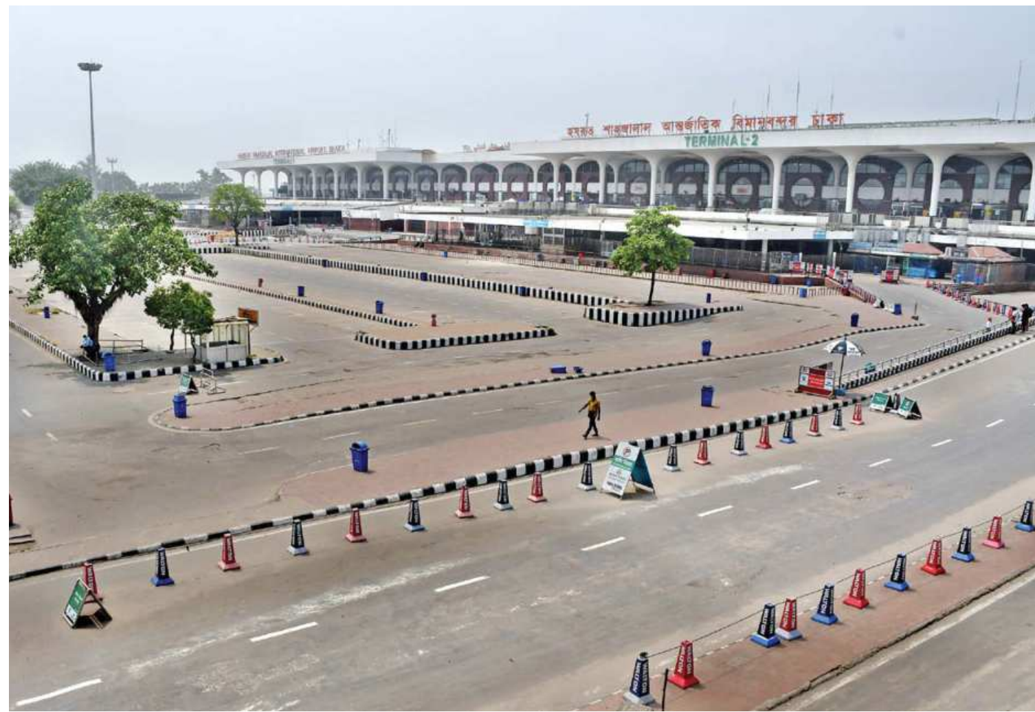
An eerily empty parking lot of the Hazrat Shahjalal International Airport in Dhaka. The country's international and domestic air travel hub usually teems with inbound and outbound passengers, but the suspension of flights amid "lockdown" means the airport is all but deserted. The photo was taken yesterday morning.