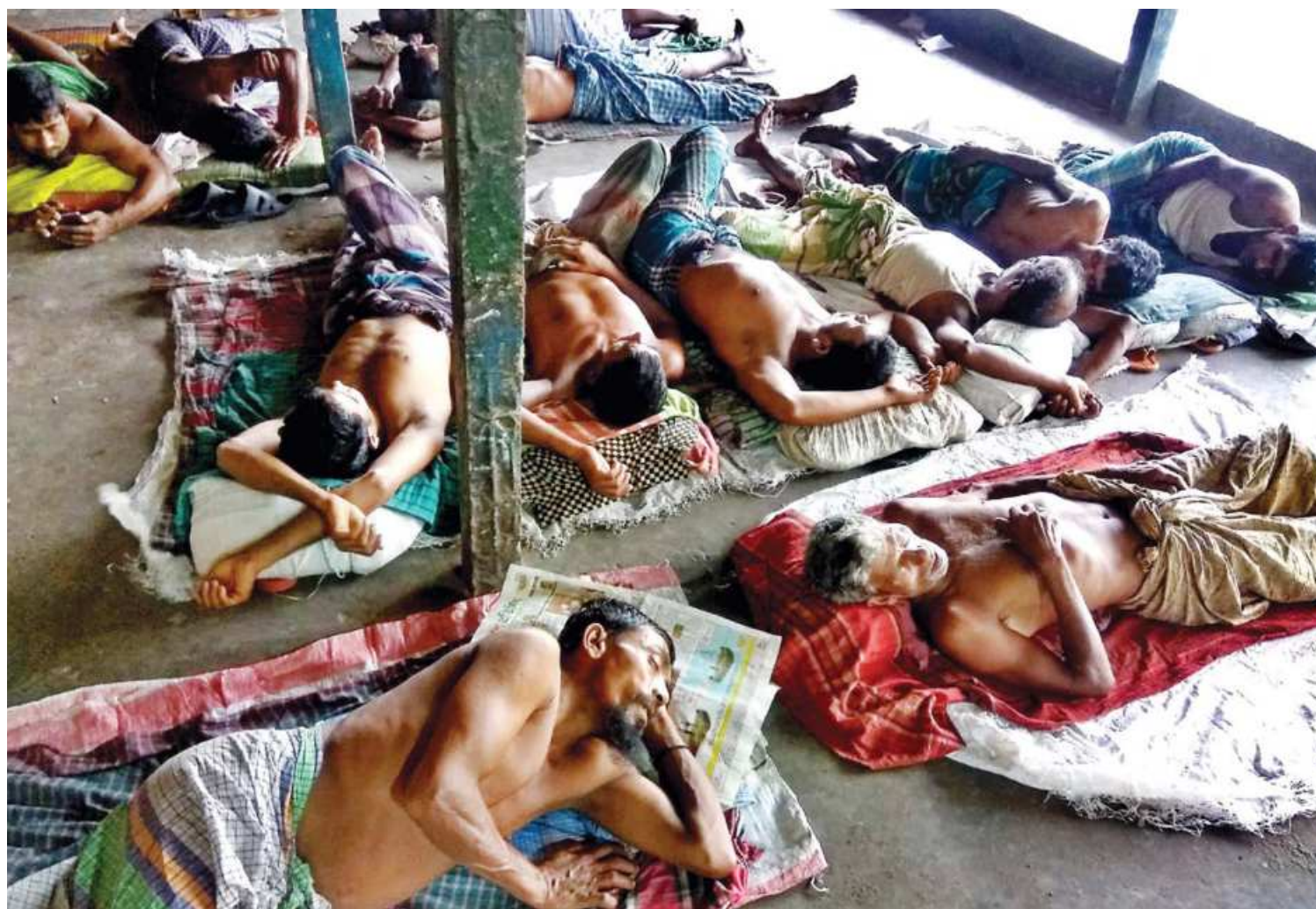
Shopkeepers of the wholesale fruit market in the capital's Karwan Bazar sleeping under a shade yesterday afternoon. Business is slow at that time of day, and in the intense heat the shopkeepers opted for some respite. They are apparently unconcerned about social distancing and wearing masks amid the Covid-19 spike.