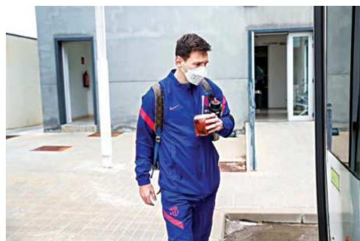
Barcelona superstar Lionel Messi arrives in Bilbao on Friday ahead of Saturday's Copa del Rey final against Athletic Bilbao.

The 2020 final between Utrecht and Feyenoord was cancelled after the Dutch season was terminated early as a result of the pandemic.