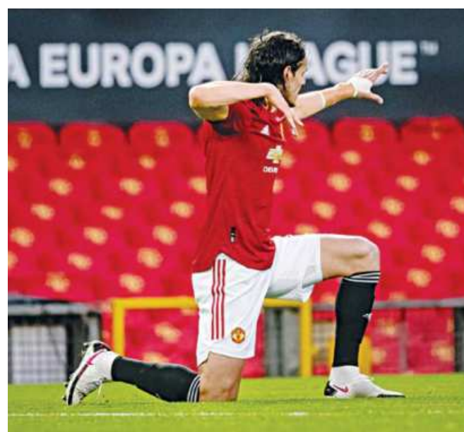
Edinson Cavani scored in the sixth minute as Manchester United won 2-0 on the night against Granada for a 4-0 aggregate win in their Europa League quarterfinal second leg on Thursday. The Red Devils will meet AS Roma while Unai Emery's Villarreal will play the other semifinal against Arsenal, who cruised into the last four with a 4-0 win against Slavia Prague.