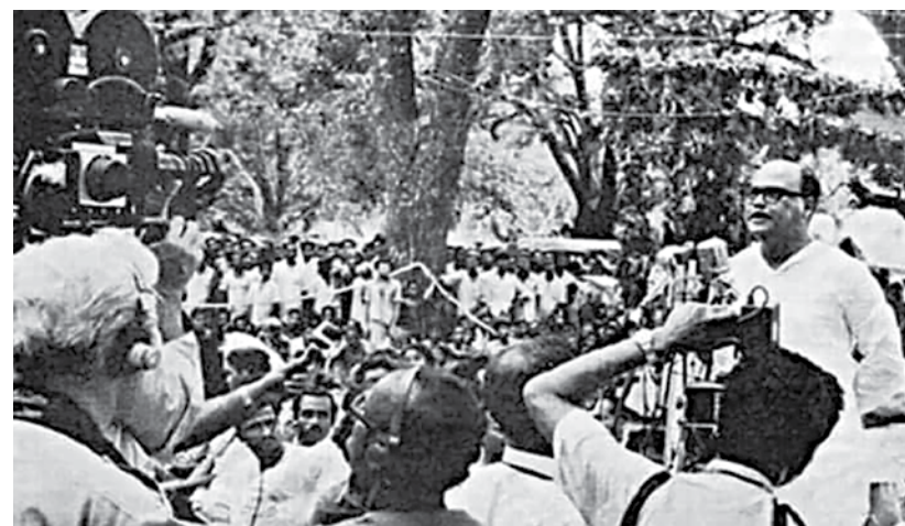
Acting President Syed Nazrul Islam speaking at the oath-taking ceremony of Mujibnagar Government on April 17, 1971.

Bangladesh was born as an independent state through the Declaration of Independence on March 26, 1971 (hence, the Independence Day) and began its sovereign life after emerging victorious on December 16 (hence, the Victory Day).