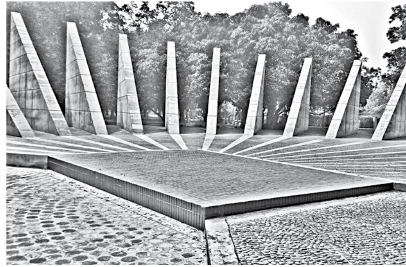
The Mujibnagar monument with 23 pillars and a brick square in the centre, which marks the spot where the Mujibnagar government ministers took their oaths.

The rundown of the events is as follows: On April 15, 1971, the GOC 33 Corps came to my unit by road from Kolkata after meeting with Lt Gen. JS Aurora, GOC-in-C, Eastern Command. He was received by my CO and 123 Brigade commander and headed to the unit operational room.