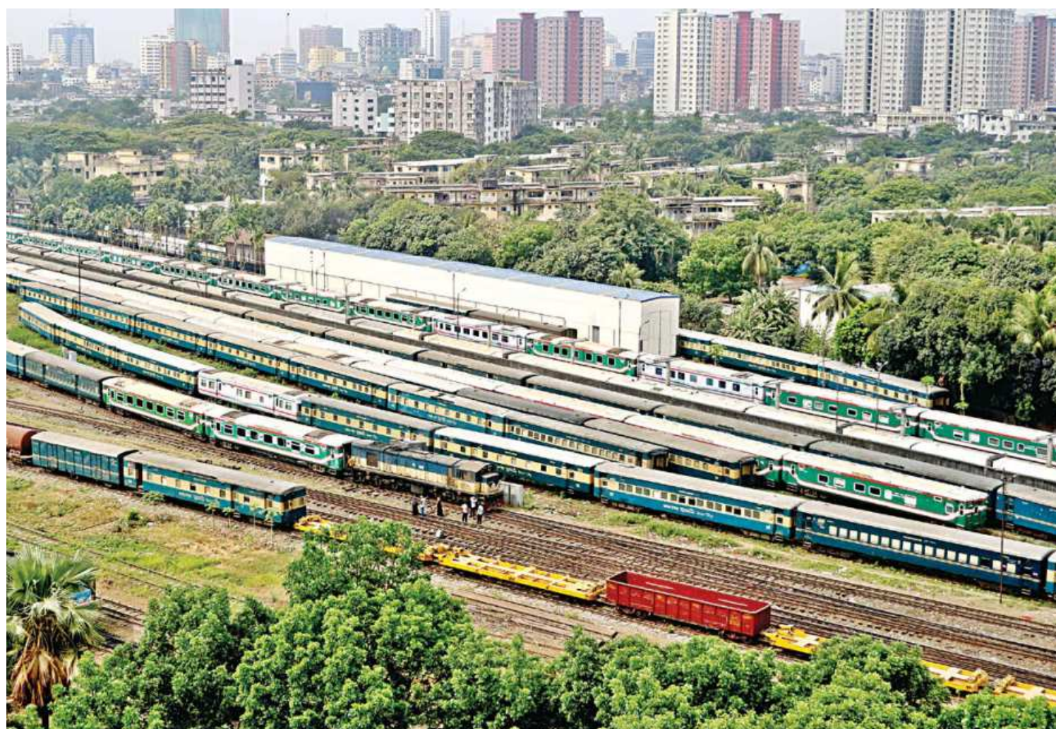
With passenger train services suspended since April 5 amid "lockdown", trains are parked outside Kamalapur Railway Station in the capital yesterday. The suspension will remain in force until April 21.

In the last assembly polls in 2016, out of these SEE PAGE 2 COL 3