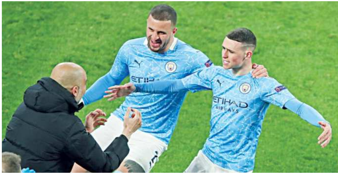
Manchester City's Phil Foden celebrates with manager Pep Guardiola and Kyle Walker after scoring their second goal during a 2-1 victory over Borussia Dortmund on Wednesday.

Zinedine Zidane has worked wonders with what a few months ago was a tired-looking team in need of an overhaul, their spine