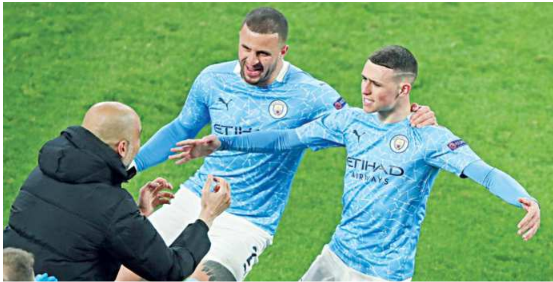
Manchester City's Phil Foden celebrates with manager Pep Guardiola and Kyle Walker after scoring their second goal during a 2-1 victory over Borussia Dortmund on Wednesday.

Zinedine Zidane has worked wonders with what a few months ago was a tired-looking team in need of an overhaul, their spine