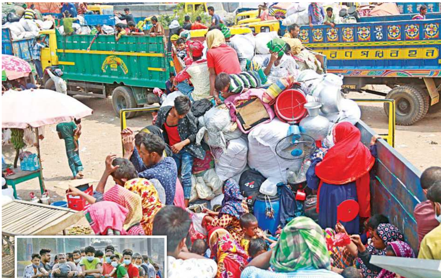
Brick kiln labourers and their family members on a truck are stuck in a long tailback near Shimulia ferry ghat in Munshiganj's Louhajang upazila yesterday. With brick kilns shut ahead of the weeklong lockdown, they are bound for their village homes in southern districts. Passengers had to endure long delays at ferry terminals yesterday as a large number of people left the capital and its adjoining districts. Inset, a truck carrying people leaves Savar's Aminbazar area.