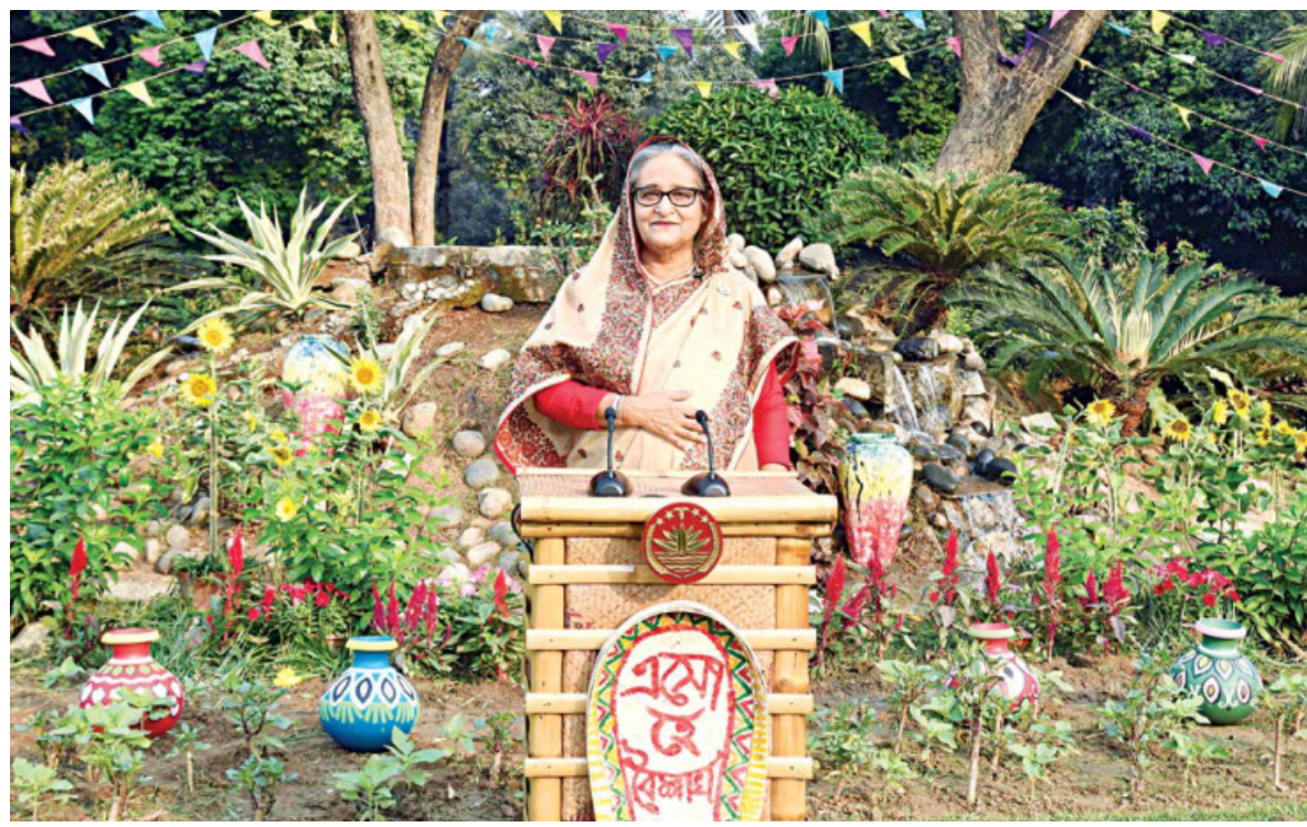
Prime Minister Sheikh Hasina addresses the nation yesterday on the eve of the Bengali New Year 1428.

Besides, there will be no iftar mahfils and sehris at mosques during the month of Ramadan this year to tackle the second wave of Covid-19 sweeping through the country.