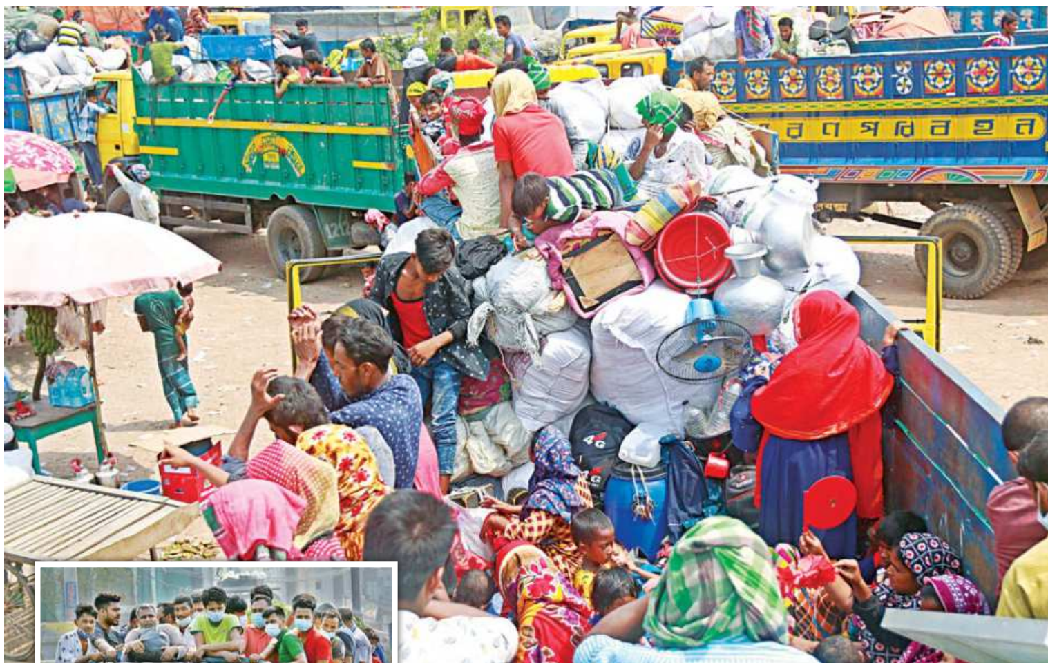
Brick kiln labourers and their family members on a truck are stuck in a long tailback near Shimulia ferry ghat in Munshiganj's Louhajang upazila yesterday. With brick kilns shut ahead of the weeklong lockdown, they are bound for their village homes in southern districts. Passengers had to endure long delays at ferry terminals yesterday as a large number of people left the capital and its adjoining districts. Inset, a truck carrying people leaves Savar's Aminbazar area.