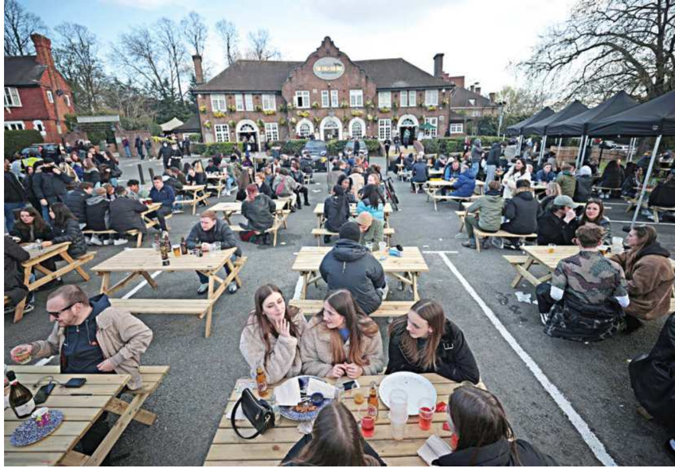
People enjoy their drinks at The Fox on the Hill pub after its reopening, as the coronavirus disease restrictions ease, in London, Britain, yesterday. Crowds queued up outside shops, pubs started selling pints at midnight and hairdressers welcomed desperate customers as England started to reopen its economy after three months of lockdown.