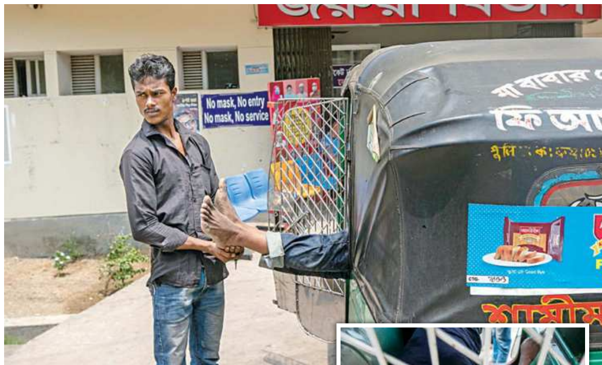
A patient's feet stick out of a CNG autorickshaw parked in front of Chattogram Medical College Hospital, while he is writhing in pain holding onto the grill of the vehicle (inset). Due to an acute shortage of stretchers and wheelchairs for transporting patients into the hospital, they have to endure a long wait outside the hospital. The photos were taken yesterday.