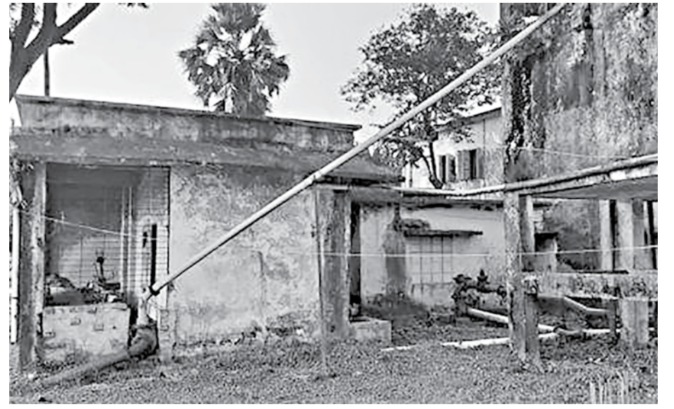
Shayestaganj Fisheries Extension and Training Centre in Habiganj has been running with many problems including dilapidated office buildings, broken furniture, decaying boundary walls and silted up ponds for long.

They have assured us that manpower will be recruited soon," Khasru said.