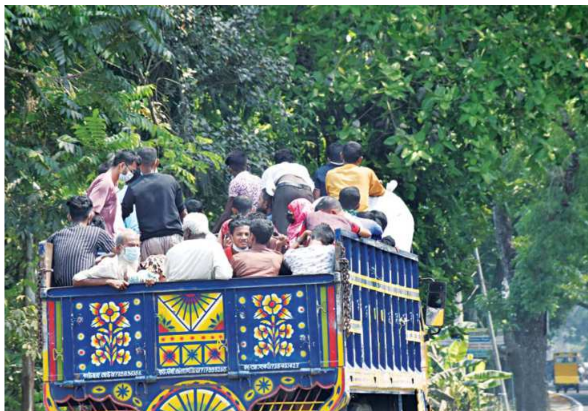
Droves of people on trucks, buses and in three-wheelers arrived at Barishal yesterday, just before the lockdown. Social distancing is almost impossible to maintain in these situations, and some didn't even bother with face-masks. This photo was taken from Barishal-Dhaka Highway Retritola area.