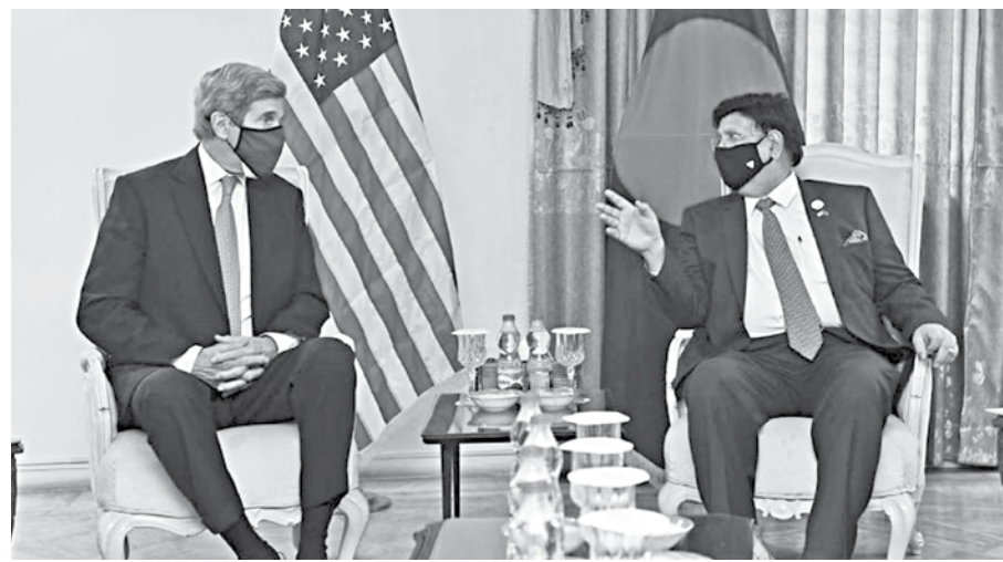
US Special Presidential Envoy for Climate John Kerry with Foreign Minister AK Abdul Momen at State Guest House Padma on Friday, 9 April, 2021.

The challenge for the US will be to get all the other countries to deliver their promised amounts for both 2020 as well as 2021. An associated issue with the amounts made available is with the distribution for developing countries to either tackle mitigation or adaptation