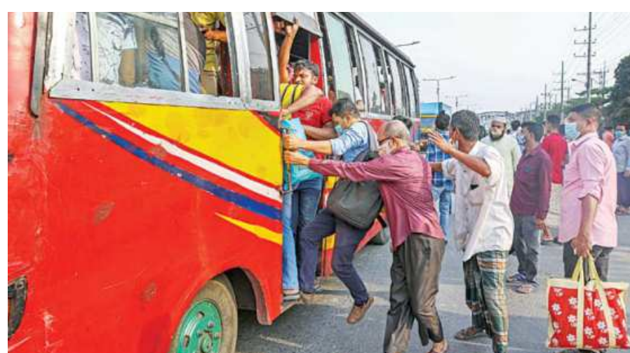
Port city residents jostle to board an already full bus on AK Khan Road ahead of the nationwide lockdown. Although inter-district buses were barred from plying, some were seen taking or dropping off passengers yesterday, evading authorities.