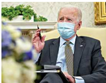
US President Joe Biden

Much of that money will likely go towards the construction of multi-billion-dollar advanced chip plants by Intel,