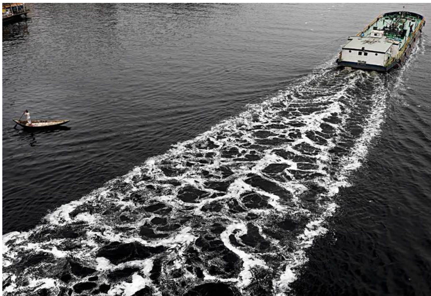
A sand-laden vessel sails through the Buriganga river, which flows past the southwest outskirts of Dhaka city. It is now considered one of the most polluted rivers in the world. Rampant dumping of human and industrial waste for years now has been the primary cause for such pollution. The photo was taken yesterday.