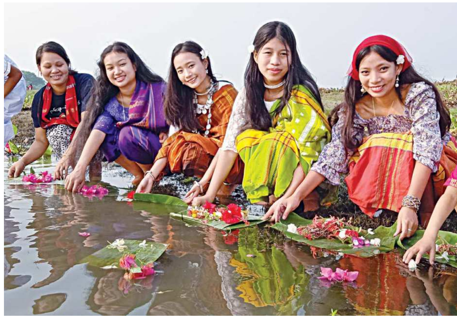
Yesterday was Ful Biju celebrations. During this festival, Chakma people get up early, clean their homes and decorate them with flowers. They then release flowers onto rivers, canals and springs to seek blessings from the God of peace and prosperity. In the evening, they fill Buddhist temples with lit candles. The photo was taken yesterday.