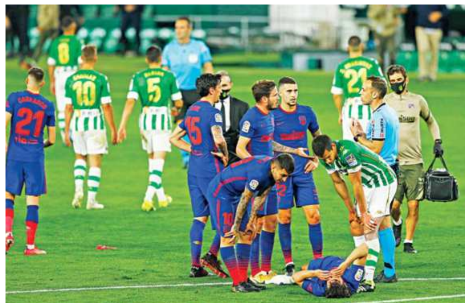
Atletico Madrid's record signing Joao Felix sustained an injury during a 1-1 draw to Real Betis on Sunday. Right-back Kieran Trippier also suffered injury in the second half, adding to an absentee list also containing Luis Suarez, Thomas Lemar and latest signing Moussa Dembele.

"We made an excellent start but when there was little danger they managed to score. We kept trying and we've dropped two points but we're still top and our fate is in our own hands," said Atletico captain Koke.