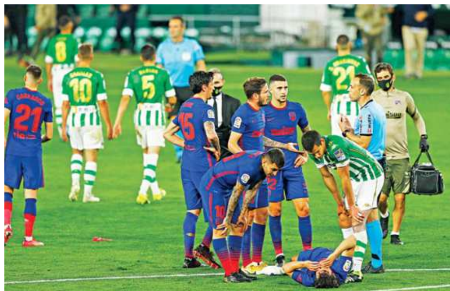
Atletico Madrid's record signing Joao Felix sustained an injury during a 1-1 draw to Real Betis on Sunday. Right-back Kieran Trippier also suffered injury in the second half, adding to an absentee list also containing Luis Suarez, Thomas Lemar and latest signing Moussa Dembele.

"We made an excellent start but when there was little danger they managed to score. We kept trying and we've dropped two points but we're still top and our fate is in our own hands," said Atletico captain Koke.