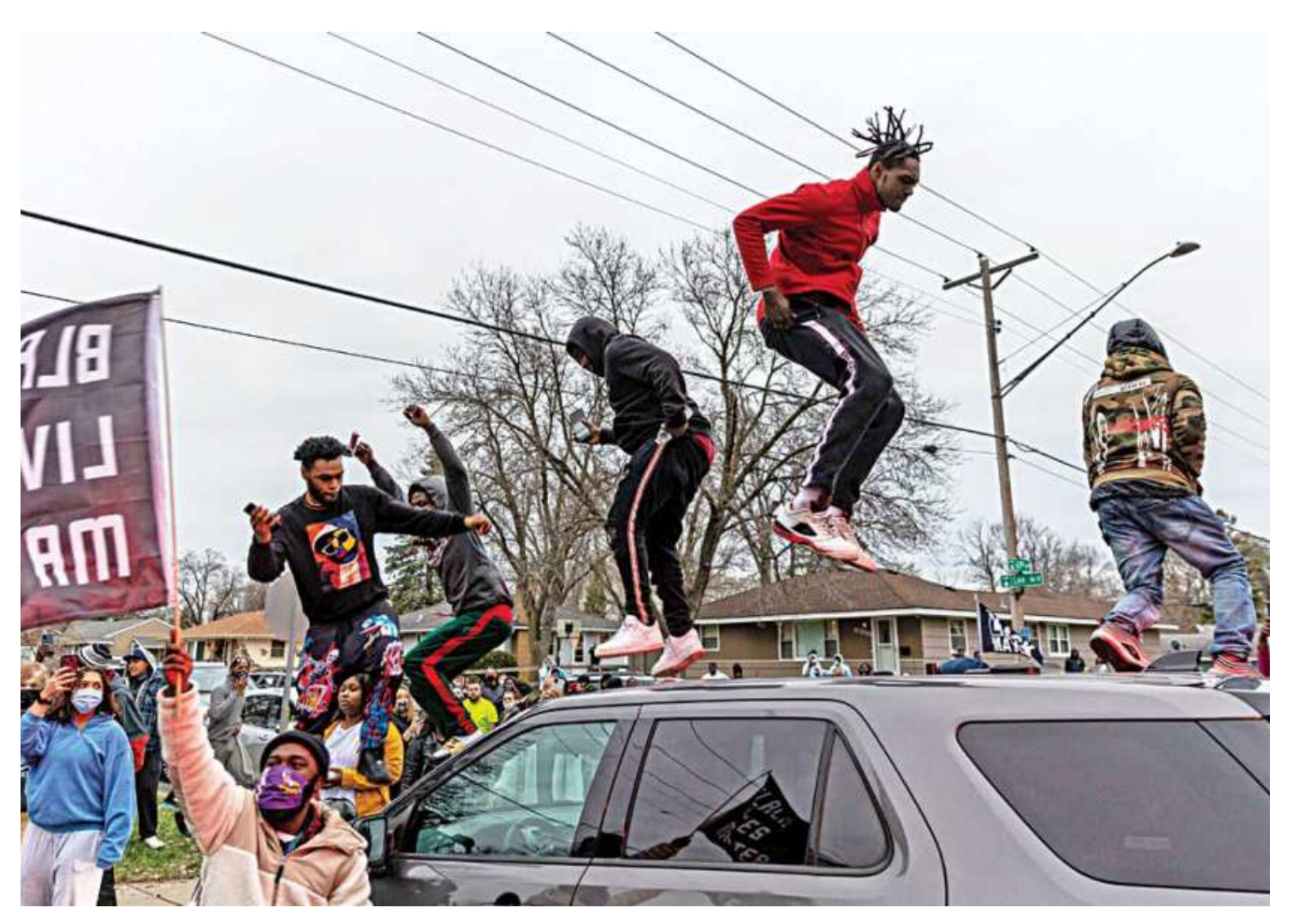
Protesters stand on top of a police car as they clash after an officer shot and killed a black man in Brooklyn Center, Minneapolis, Minnesota, US on Sunday. Hundreds of people gathered outside a police station in Brooklyn Center, northwest of Minneapolis, with police later firing teargas and flash bangs to disperse the crowd.