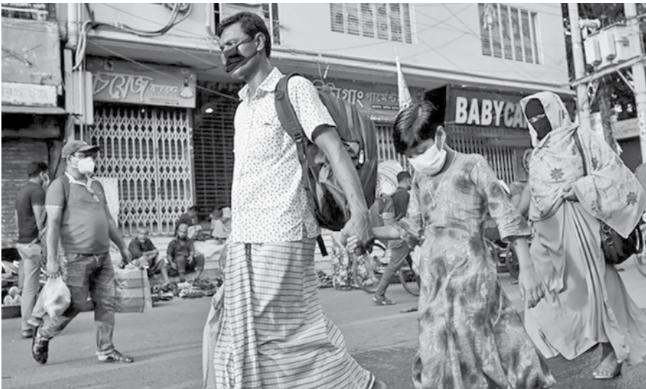
Bangladesh economy, like the global economy, is still struggling to recover from the adverse impacts of the pandemic.

percent of the country’s gross domestic product (GDP) for the large businesses, export-oriented industries, small enterprises, agriculture sector, and social safety net programmes. Since the stimulus packages were mostly in the form of liquidity support through commercial banks, the government had also introduced expansionary monetary policy measures to create liquidity for the banks. However, these support measures were not adequate compared to the losses