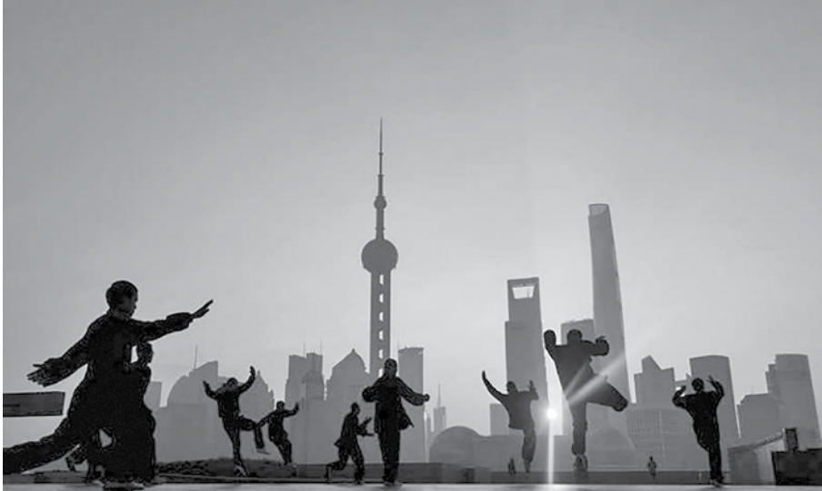
People doing morning exercises in front of the skyline of the Lujiazui Financial District in Pudong in Shanghai.

which is the single biggest obstacle to the development of collective Asian leadership. After all, Asia still relies heavily on the US for peace and security. Many countries, including Australia, Japan, the Philippines, and South Korea, are US allies and do not want to choose sides. Within the framework of the Quadrilateral Security Dialogue, or the Quad, the US, Japan, India, and Australia are strengthening ties to confront China’s