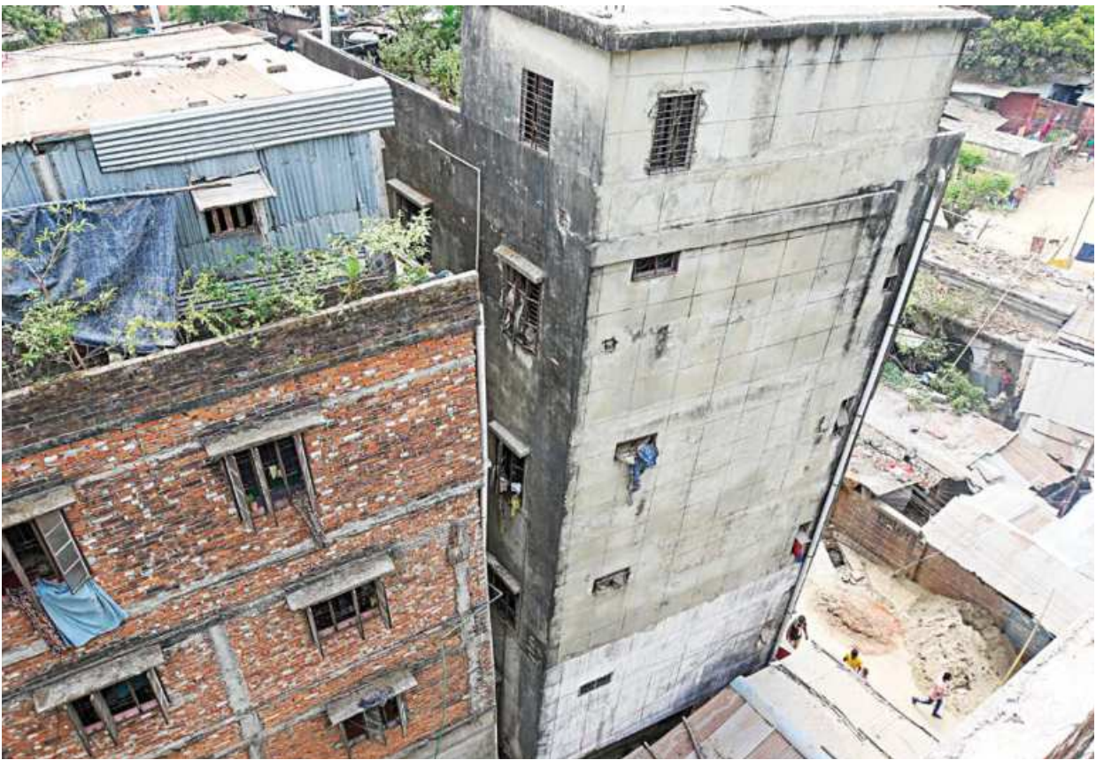
A five-storey building in port city's Enayetbazar area tilted around 9:30pm on Saturday night while piling was undergoing on the ground floor.