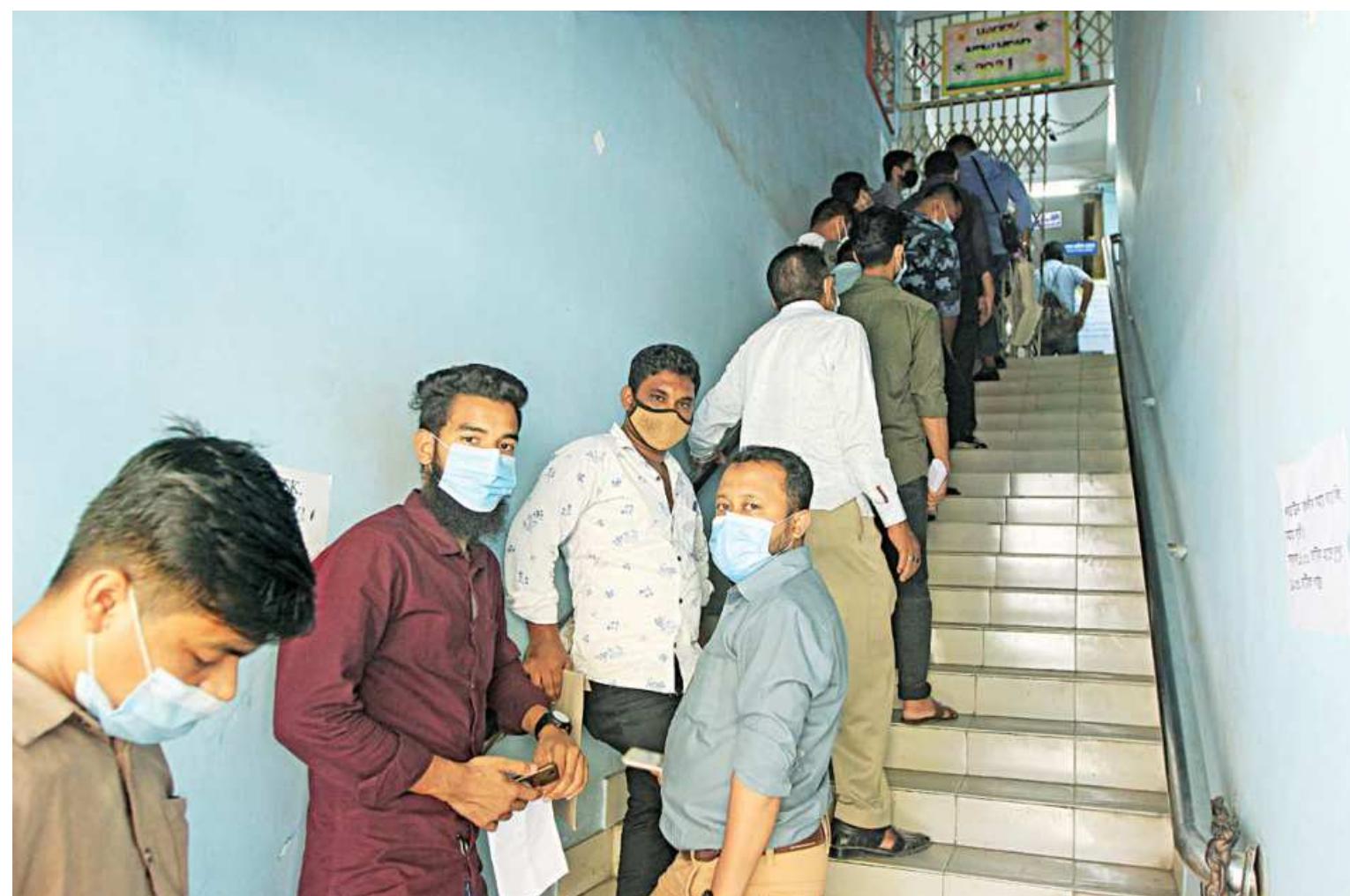
Banks are witnessing a mad rush of clients seeking to withdraw funds apprehending a strict lockdown in the days ahead. The photo was taken at a bank near Hotel Razmoni Ishakha in the capital around 11:00am yesterday.