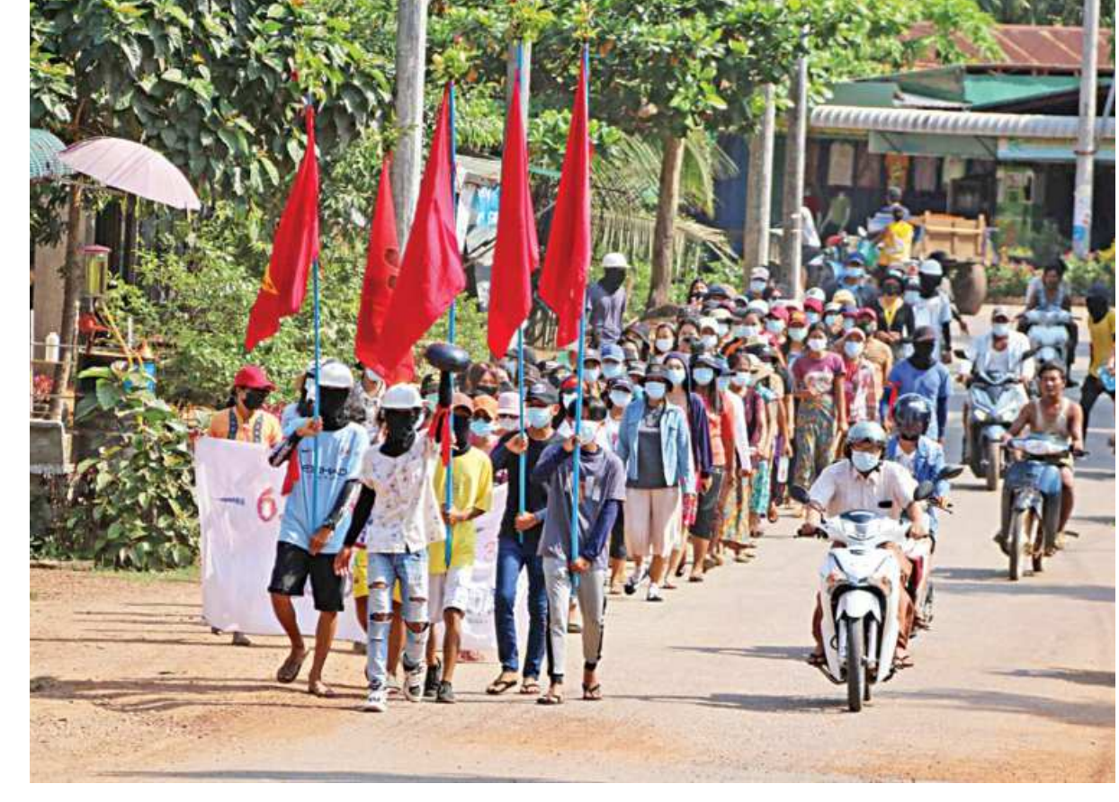
This handout photo taken and released by Dawei Watch yesterday shows protesters holding flags as they march in a demonstration against the military coup in Launglone township in Myanmar's Dawei district.

The report predicts that such an outcome would exacerbate political tensions and conflict in western Pakistan and sharpen the India-Pakistan rivalry by strengthening longstanding judgments about covert warfare in Islamabad and New Delhi.