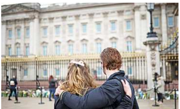
(From top, anti-clockwise) The Death Gun Salute is fired by the Honourable Artillery Company to mark the passing of Britain's Prince Philip at the The Tower of London, in London, yesterday, the day after his death at the age of 99; a grieving couple embrace outside Buckingham Palace; in this file photo taken on July 11, 1947 Princess Elizabeth and Prince Philip pose on the day of their engagement; and a well-wisher waits in line to lay a floral tribute to Prince Philip in central London.