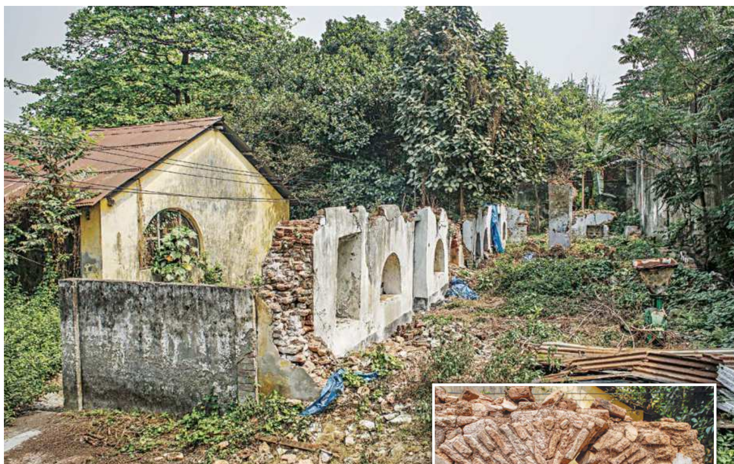
The ruins of a Sultanate-era building inside the old central jail compound in the capital's Chawkbazar area. The wall is thought to be a part of a fort. Even though a technical committee formed in 2016 appointed an archaeologist to excavate the site, no report of the work has yet been published.