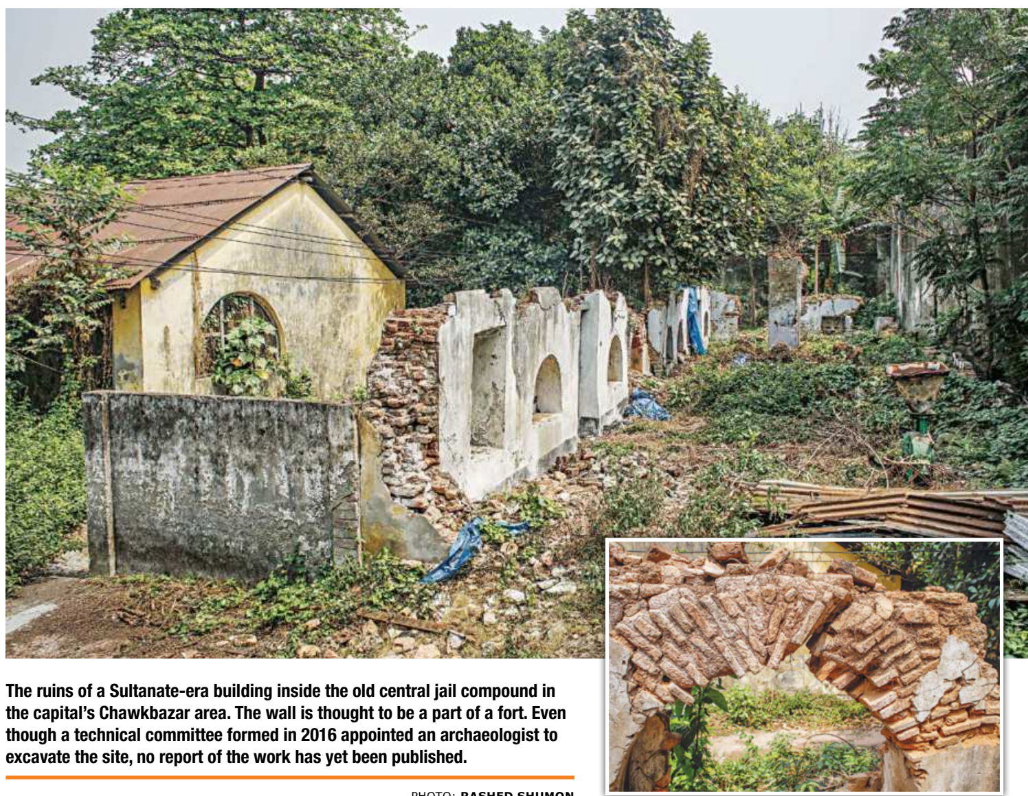
The ruins of a Sultanate-era building inside the old central jail compound in the capital's Chawkbazar area. The wall is thought to be a part of a fort. Even though a technical committee formed in 2016 appointed an archaeologist to excavate the site, no report of the work has yet been published.