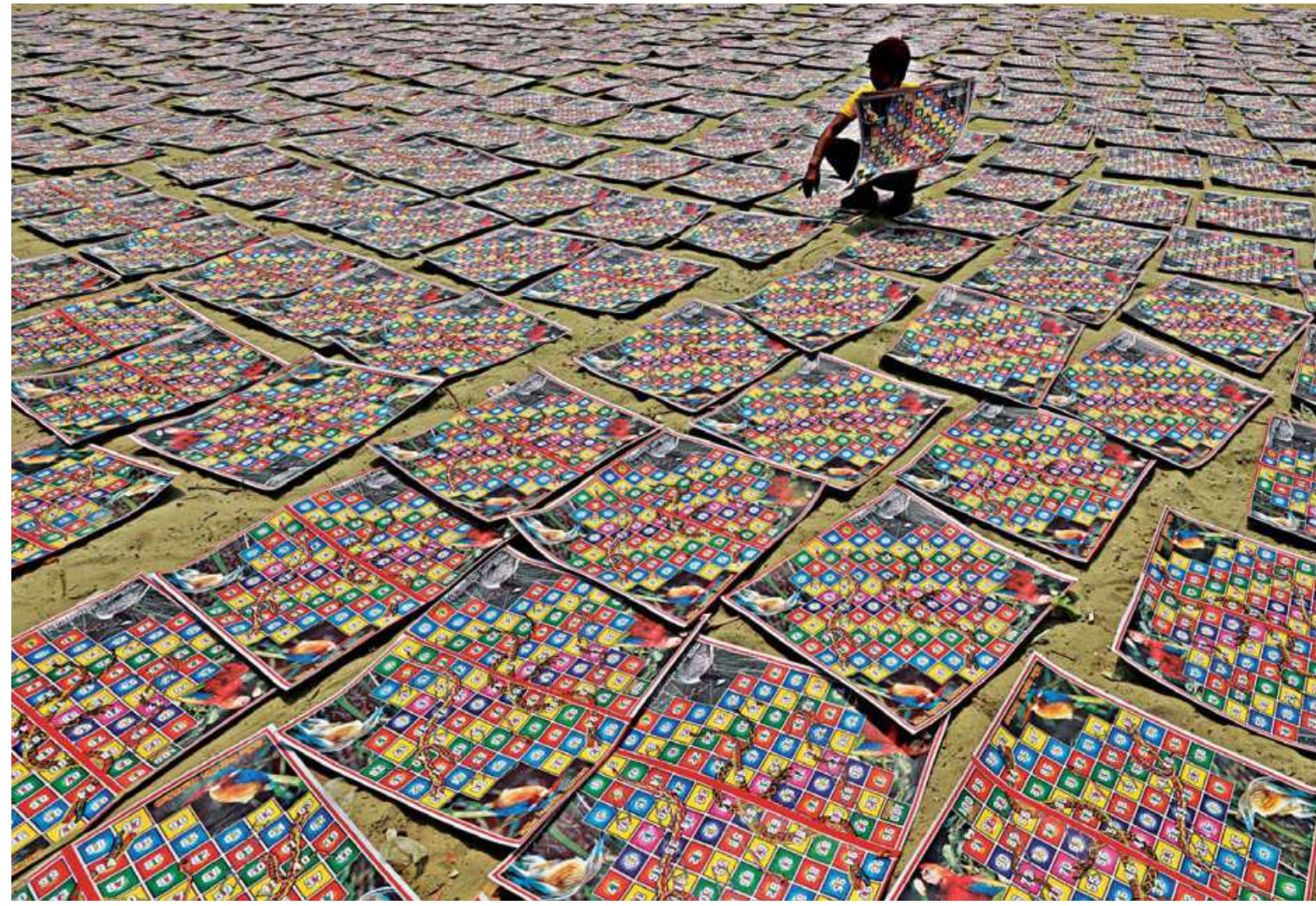
Entrepreneur Rayhan, 32, sun-drying paper-made ludo and snakes and ladders boards on Noyabazar playground in the capital. He sells each board for Tk 25 to different wholesale markets while producing those for Tk 15-17. The photo was taken recently.