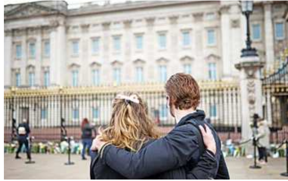
(From top, anti-clockwise) The Death Gun Salute is fired by the Honourable Artillery Company to mark the passing of Britain's Prince Philip at the The Tower of London, in London, yesterday, the day after his death at the age of 99; a grieving couple embrace outside Buckingham Palace; in this file photo taken on July 11, 1947 Princess Elizabeth and Prince Philip pose on the day of their engagement; and a well-wisher waits in line to lay a floral tribute to Prince Philip in central London.