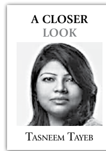
A CLOSER LOOK