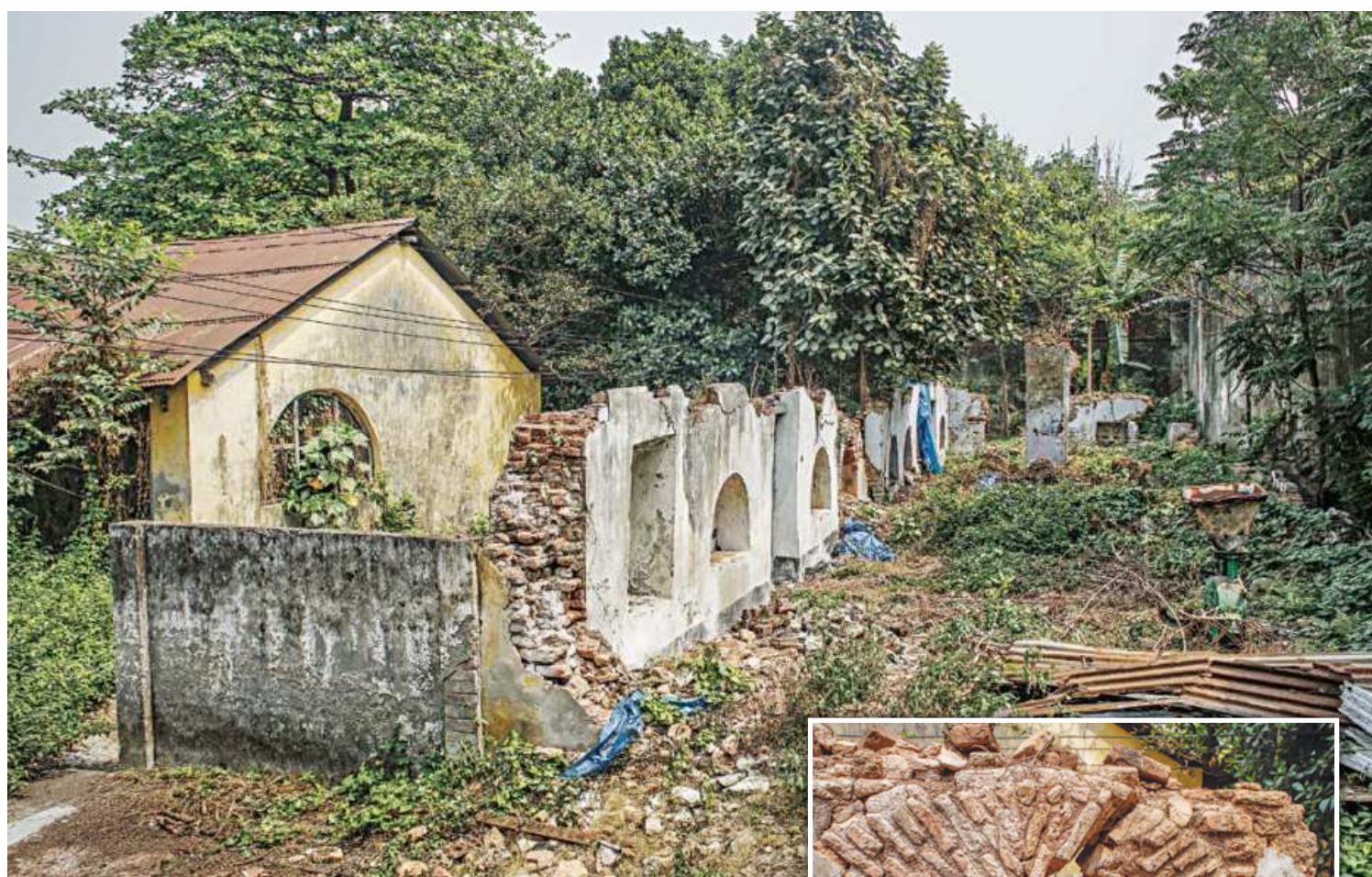
The ruins of a Sultanate-era building inside the old central jail compound in the capital's Chawkbazar area. The wall is thought to be a part of a fort. Even though a technical committee formed in 2016 appointed an archaeologist to excavate the site, no report of the work has yet been published.