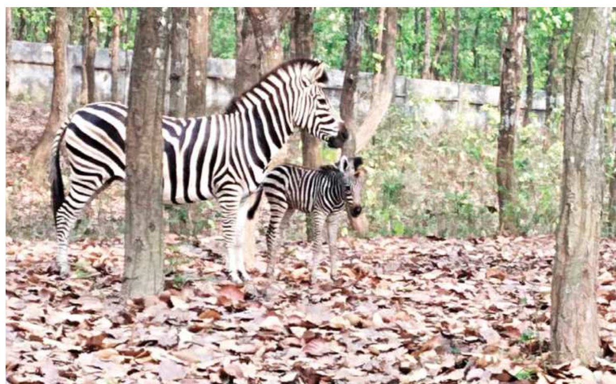
A newborn foal and the mother Zebra at Bangabandhu Sheikh Mujib Safari Park in Gazipur. Though the park remained closed for most of 2020, one silver lining can be found in its increasing zebra population. In the last two years, 11 foals were born, while another eight zebras are waiting to give birth. Park authorities credit the increase in the animals' comfort during the closure as the most important contributing factor to the rise in breeding. The photo was taken on Friday.