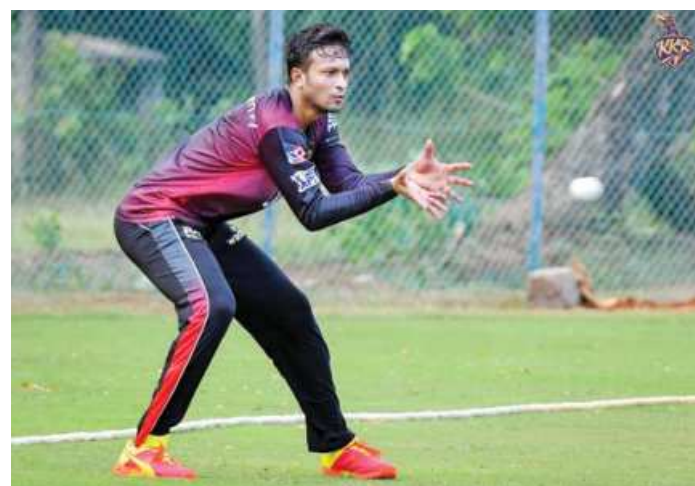
Bangladesh and Kolkata Knight Riders (KKR) all-rounder Shakib Al Hasan works on his catching skills during a training session yesterday ahead of his side's opening match against Sunrisers Hyderabad at the M Chinnaswamy Stadium today.

and bring back the glorious days of two-time IPL champions. Meanwhile, the Bangladesh cricket fraternity will be eagerly waiting to see Shakib Al Hasan back in action in the IPL for his former franchise (KKR). Shakib was part of KKR title-winning campaigns in 2012 and 2014 and was bought by his former franchise for Rs 3.2 crore. In the opening match on Friday, South Africa's AB de Villiers hit a quickfire 48 as Royal Challengers Bangalore (RCB) prevailed in a last-ball thriller against holders Mumbai Indians. RCB captain Virat Kohli later said he believes Harshal Patel has solved the team's death-overs woes following the seamer's bowling masterclass in Friday's victory. Patel claimed three wickets in four balls in the dramatic 20th over and conceded only one run to help restrict a star-studded Mumbai to a modest 159-9.