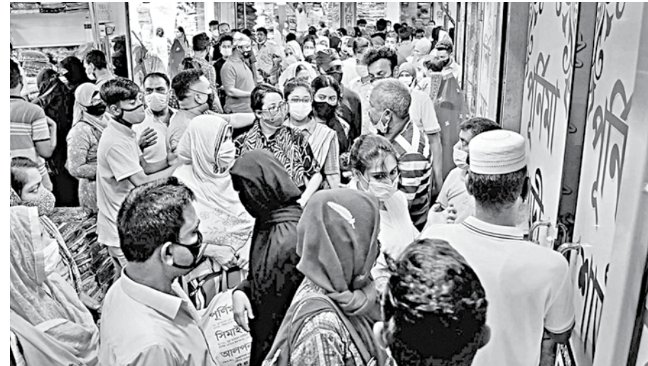
Customers throng Noor Mansion Shopping Centre in the capital's New Market area on the first day of reopening of malls after a brief four-day closure during the ongoing 'lockdown'.

Also the first few two days of the lockdown were marked by anti-lockdown protests from various quarters across the country, with protests turning violent in some areas of the country, including