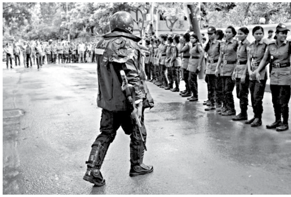
The latest instruction is even more problematic since Bangladesh police, in recent years, has increasingly been criticised by human rights groups and observers for brutality and lack of accountability.

Though it is quite astonishing that our police force is still regulated by the Police