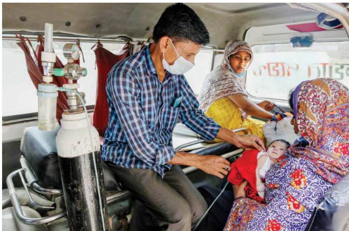
With the sharp rise of Covid-19 cases, patients of all kinds, including this baby -- suffering from respiratory complications since birth -- cannot avail essential medical care, as hospitals are already running beyond capacity. The little one's family had been running from one place to another in search of available healthcare facilities, and were seen waiting in an ambulance at Chattogram Medical College Hospital yesterday, hoping for some service.

"May the Almighty bequeath courage and fortitude to Your Majesty, the member of the bereaved Royal family and the People of United Kingdom to bear with this irreplaceable loss."