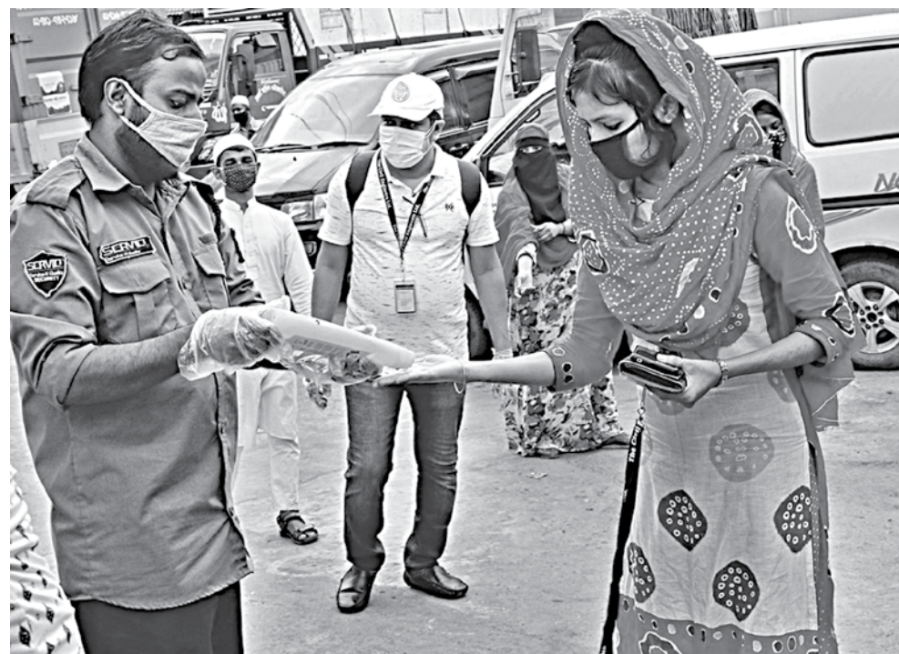
A garment worker takes hand sanitiser from the gatekeeper in front of a factory in Dhaka's Tejgaon industrial area.