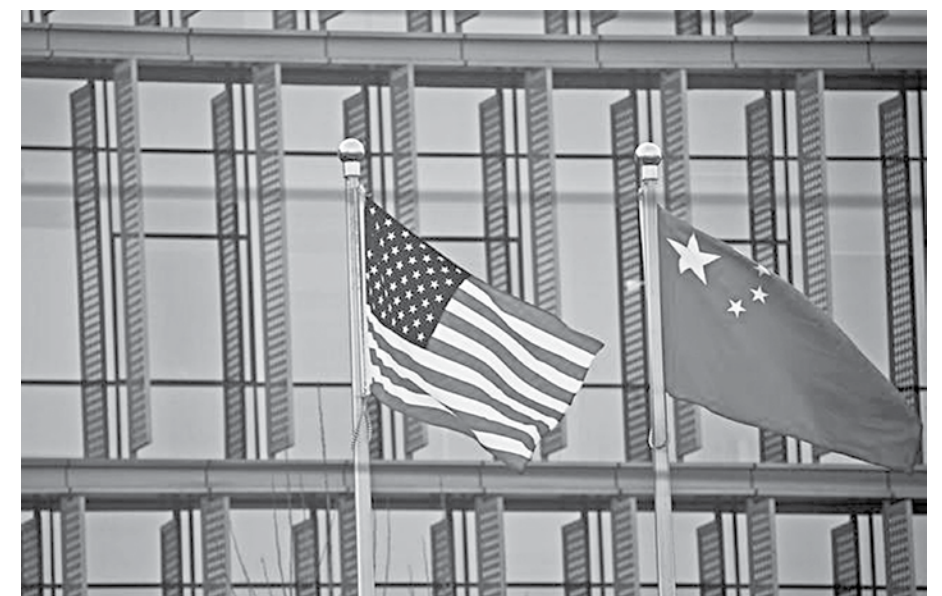
Chinese and US flags flutter outside the building of an American company in Beijing, China, January 21, 2021.

As governments assume larger roles in the US, Europe and China, the issue is how to deliver performance along the whole range of military, economic, social, technological and organisational dimensions, without capture, corruption, concentration and widening social injustices. So far, American free markets have allowed the 1 percent to increase