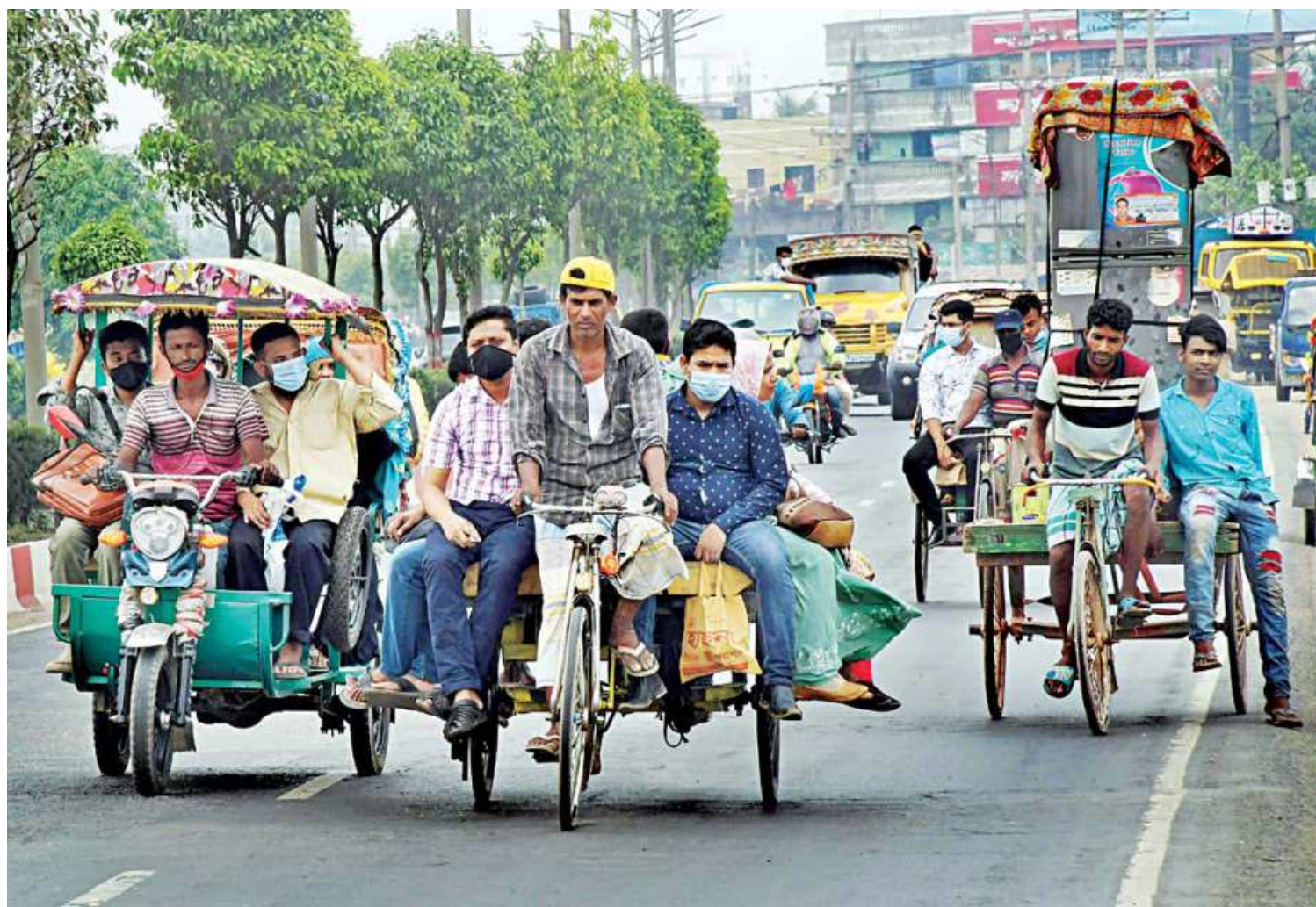
People using three wheelers on the highways for travelling long distances as the government now restricts heavy passenger vehicles on highways during the "lockdown" that has been imposed to curb the spread of coronavirus. The photo was taken in Dhaka's Aminbazar.