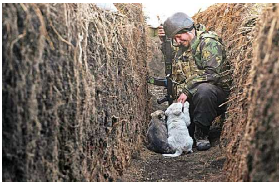
A service member of the Ukrainian armed forces is seen at fighting positions on the line of separation from pro-Russian rebels in Donetsk region, Ukraine, yesterday. The United States will send two warships to the Black Sea next week, Turkey said on Friday as Russia, which has boosted its military forces near Ukraine, accused Nato powers of increasing naval activity in the region.