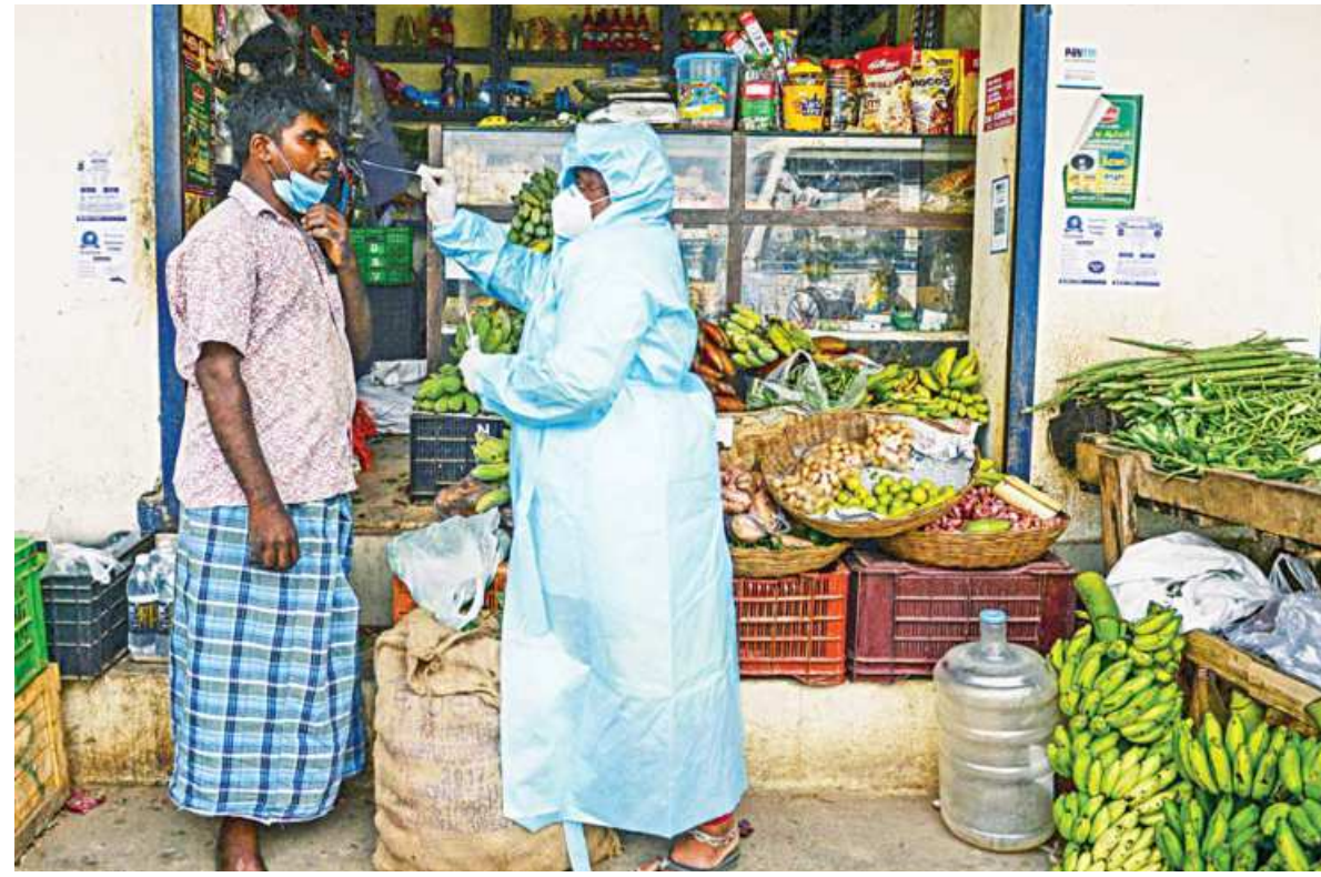
A health worker takes a swab sample from a shopkeeper for a RT-PCR Covid-19 coronavirus test in Chennai, India, yesterday