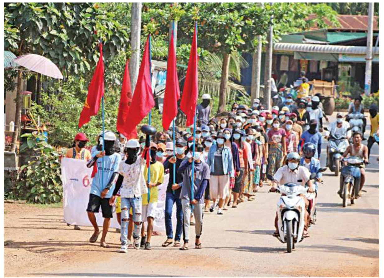
This handout photo taken and released by Dawei Watch yesterday shows protesters holding flags as they march in a demonstration against the military coup in Launglone township in Myanmar's Dawei district.

The report predicts that such an outcome would exacerbate political tensions and conflict in western Pakistan and sharpen the India-Pakistan rivalry by strengthening longstanding judgments about covert warfare in Islamabad and New Delhi.