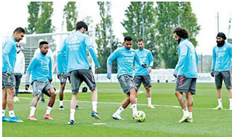
(L-R) Real Madrid and Barcelona sweated it out in training on Friday ahead of Saturday's El Clasico, the most pivotal one in recent memory, with both sides fast closing in on stuttering Atletico Madrid at the top of the La Liga table.

"They've got a great goalkeeper and of course Messi, the player