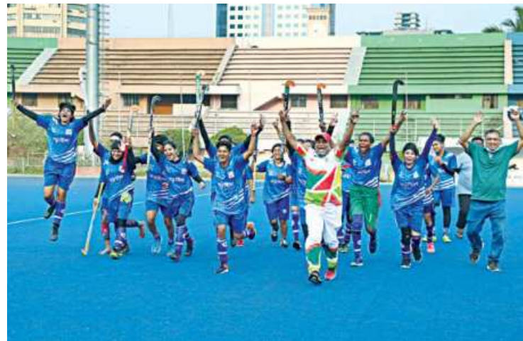
(L-R) Players of Bangladesh Ansar & VDP go wild following their 15-14 points victory over Bangladesh Police in the final of women's kabaddi event of the Bangabandhu 9th Bangladesh Games at the Kabaddi Stadium in Paltan yesterday. Narail team, meanwhile, clinched gold medal in women's hockey, beating Jhenaidah 1-0 at the Maulana Bhasani Hockey Stadium.