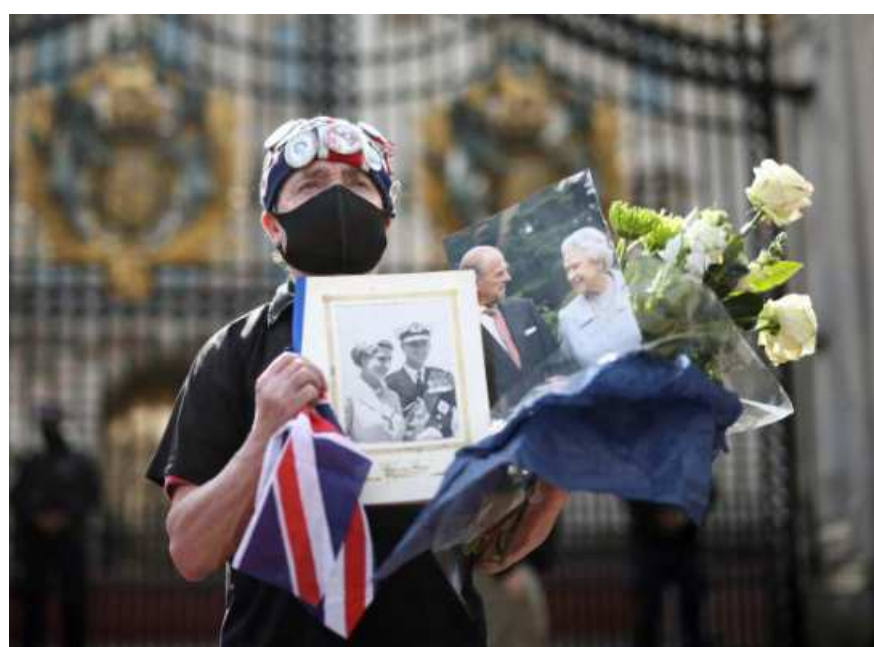
A mourner holds flowers and pictures of Britain's Queen Elizabeth II and her husband Prince Philip outside Buckingham Palace, after Prince Philip died at the age of 99, in London, Britain, yesterday.

Philip was well-known for his love of horses and the equestrian activities of polo and carriage driving, a sport in which he competed for Britain. He is also a writer and a pilot. However, the prince's passion for painting was more private. Perhaps his most famous work is a 1965 image showing his wife at breakfast reading the morning papers and titled: "The Queen at Breakfast, Windsor Castle".