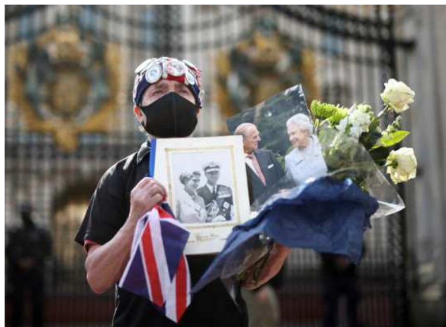
A mourner holds flowers and pictures of Britain's Queen Elizabeth II and her husband Prince Philip outside Buckingham Palace, after Prince Philip died at the age of 99, in London, Britain, yesterday.

Philip was well-known for his love of horses and the equestrian activities of polo and carriage driving, a sport in which he competed for Britain. He is also a writer and a pilot. However, the prince's passion for painting was more private. Perhaps his most famous work is a 1965 image showing his wife at breakfast reading the morning papers and titled: "The Queen at Breakfast, Windsor Castle".