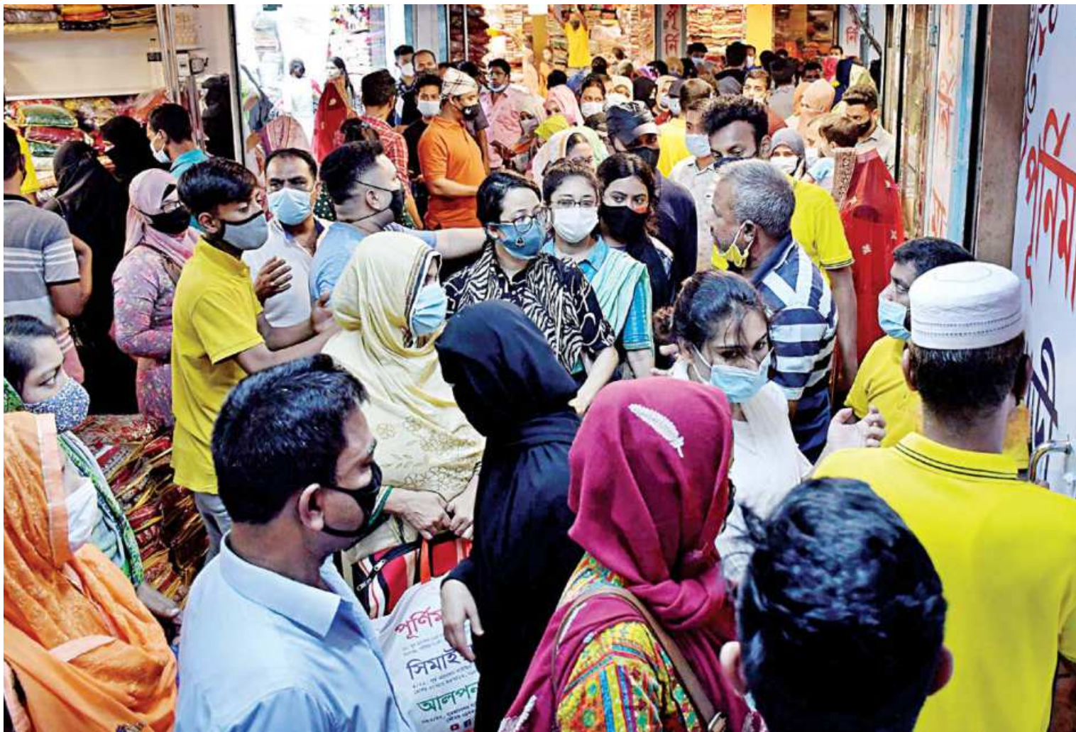
Customers throng Noor Mansion Shopping Centre in the capital's New Market area yesterday, the first day of reopening of malls after a brief four-day closure during the ongoing "lockdown". Many shoppers and salesmen showed blatant disregard for health safety rules.